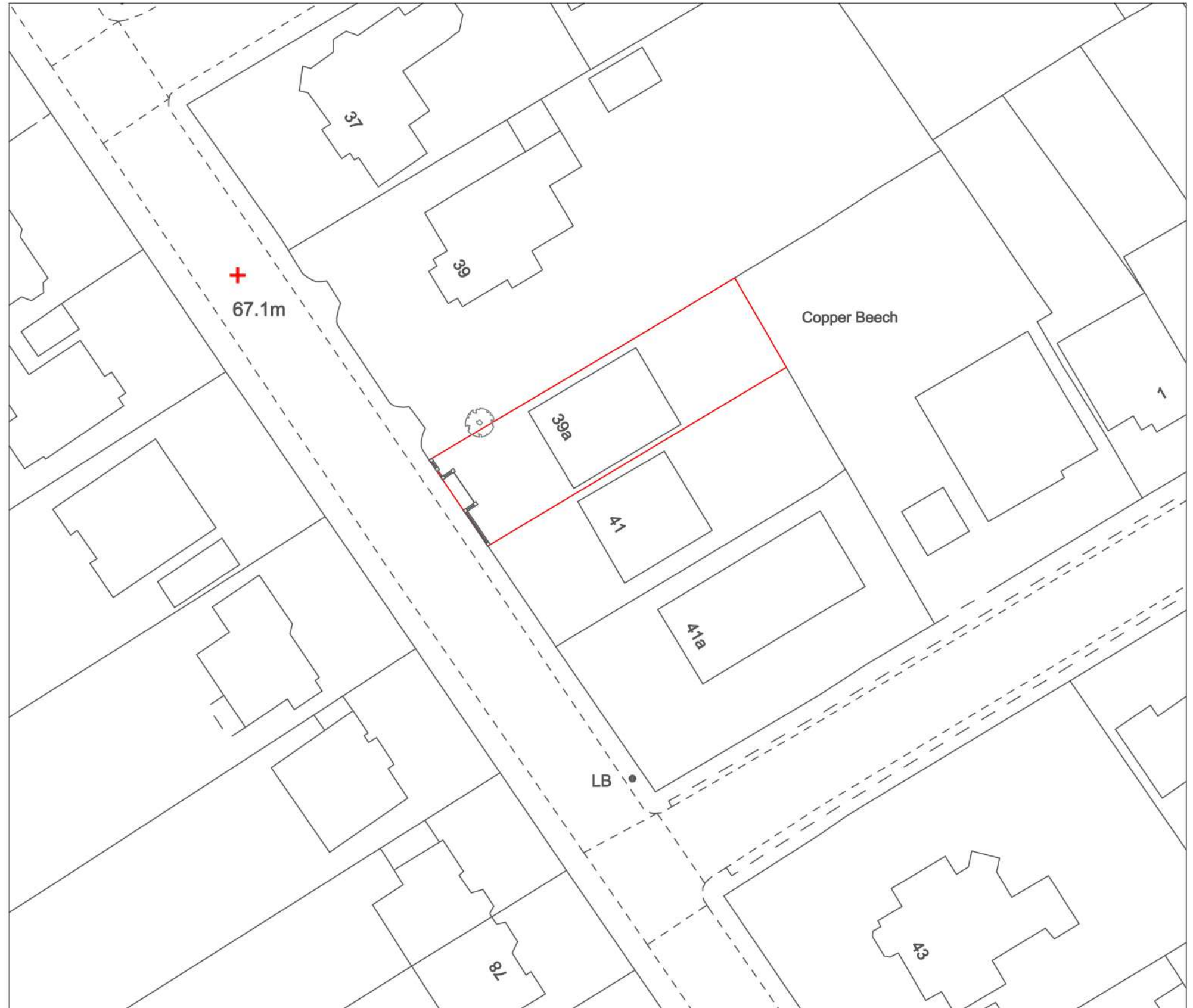
Proposed Site Plan 1:500 ⊕