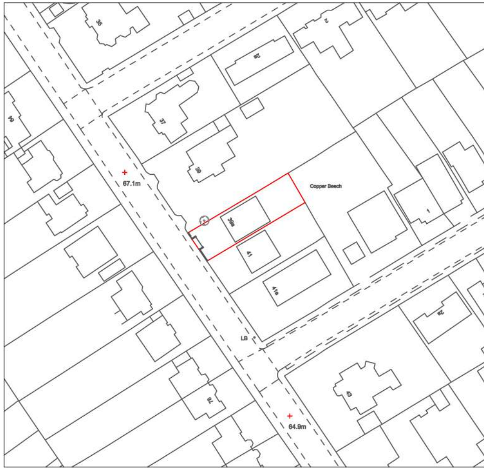
Existing Block Plan 1:1250 ⊕