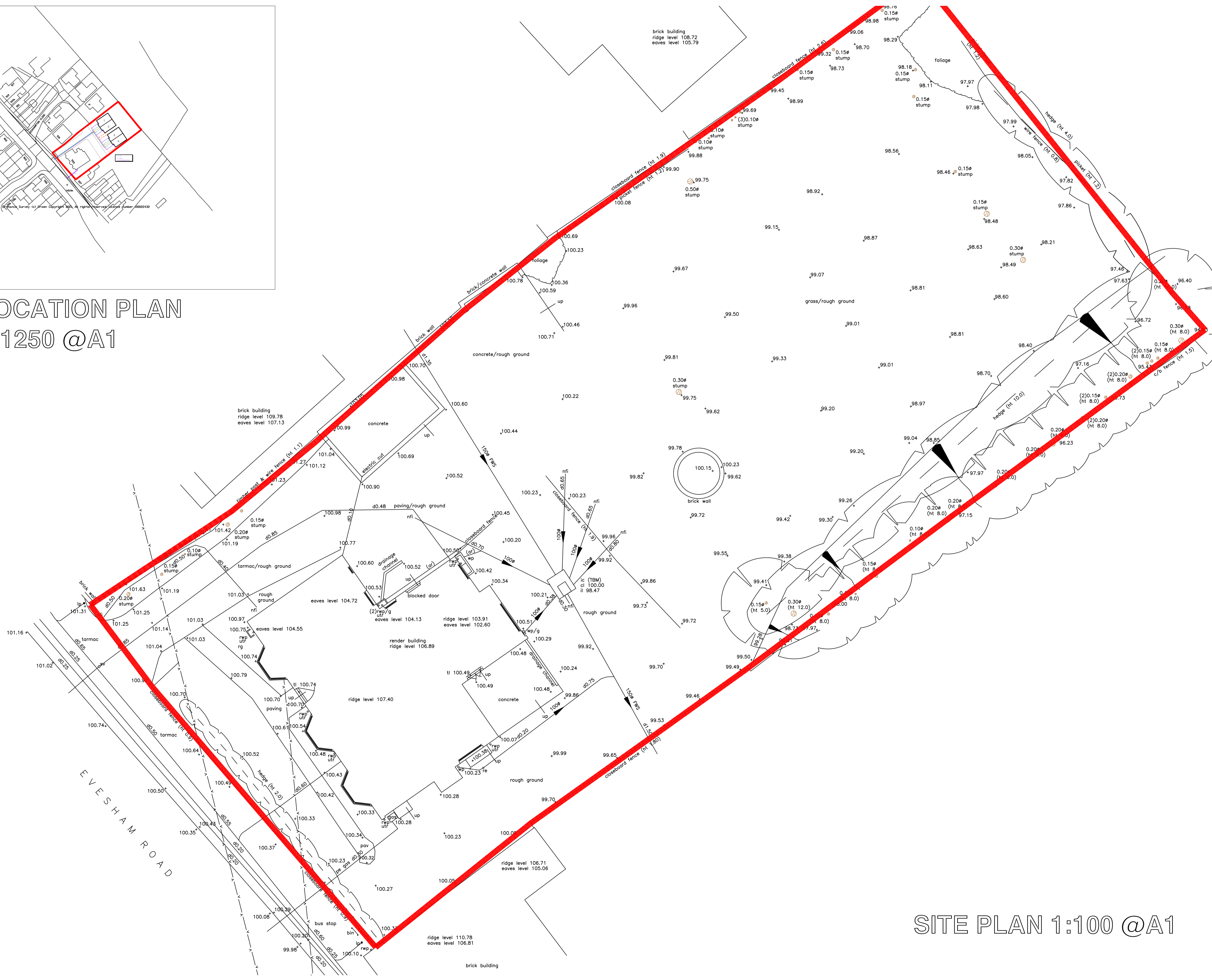
SITE PLAN 1:100 @A1

Copyright of this drawing is retained by Masefields Marchant Brabbs Limited, not to be reproduced or copied without written consent.