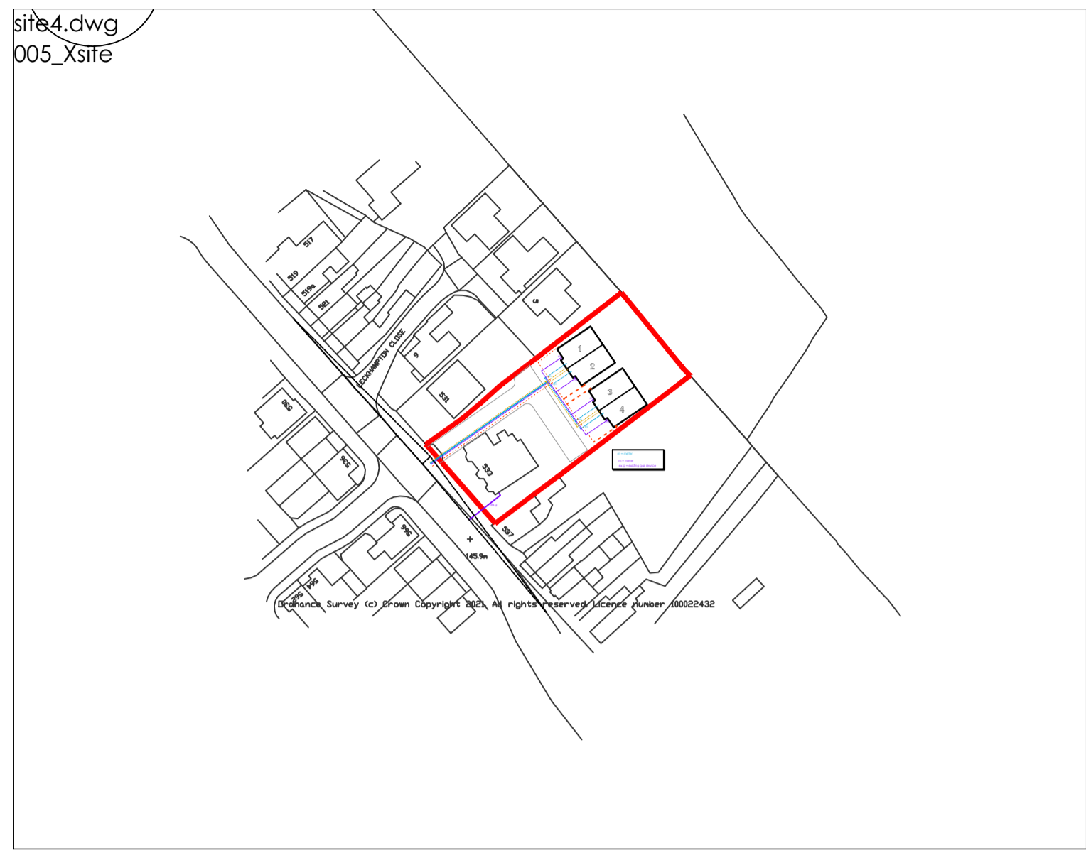
LOCATION PLAN 1:1250 @A1