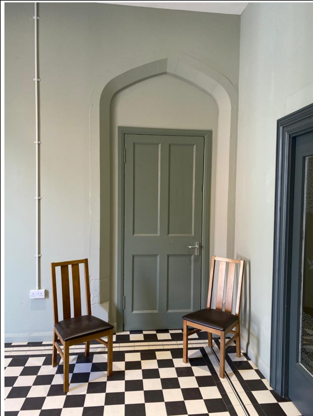
Image of original door from main entrance lobby. This door is currently boarded up internally. The current proposals include demolition of the internal boarding to reinstate the door to allow it to be used as the main entrance into the dental practice.