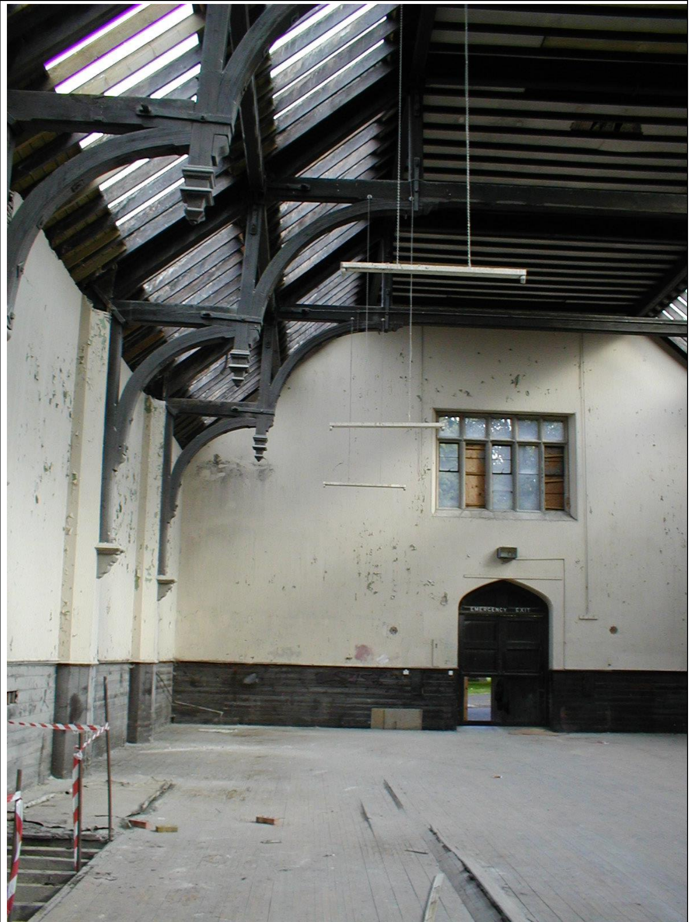
Internal image taken prior to the changes proposed in planning application ref 04/01191/COU. View of side wall looking toward rear.