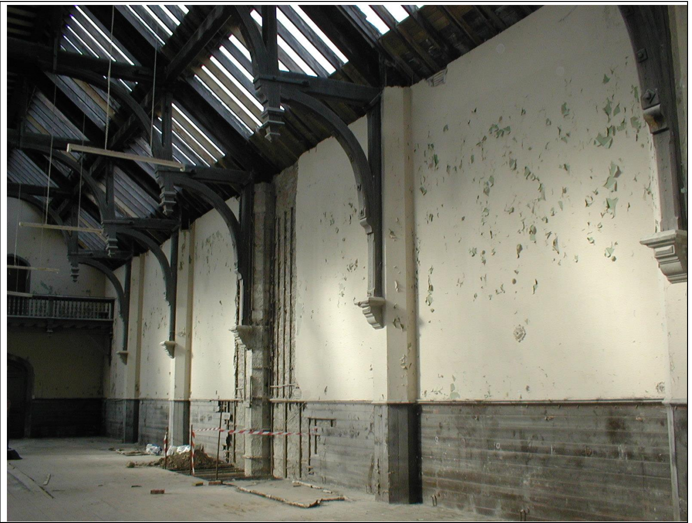
Internal image taken prior to the changes proposed in planning application ref 04/01191/COU. View of side wall looking toward front.