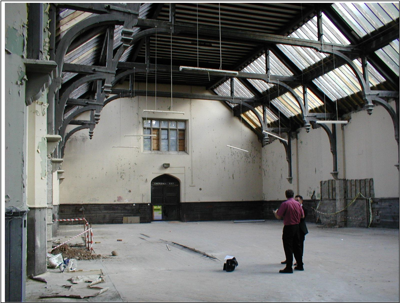
Internal image taken prior to the changes proposed in planning application ref 04/01191/COU. View of main hall looking toward rear elevation.