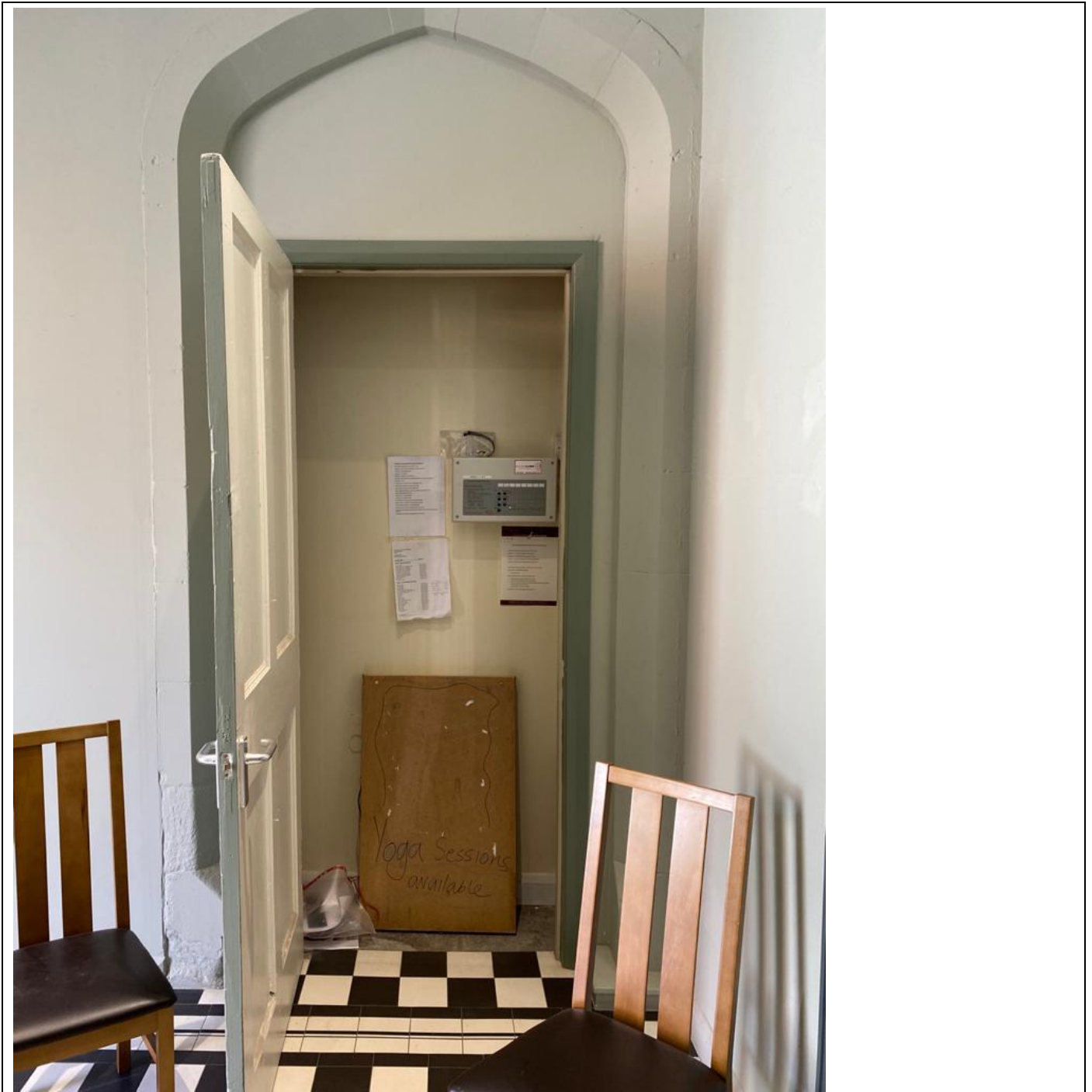
Image of original door from main entrance lobby. This door is currently boarded up internally. The current proposals include demolition of the internal boarding to reinstate the door to allow it to be used as the main entrance into the dental practice.