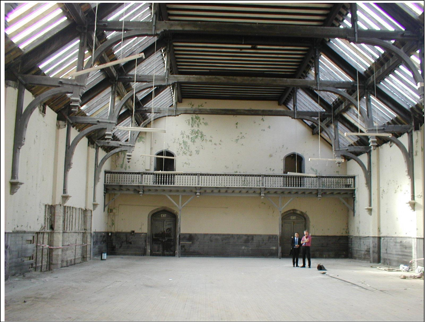
Internal image taken prior to the changes proposed in planning application ref 04/01191/COU. View of main hall looking toward front elevation.