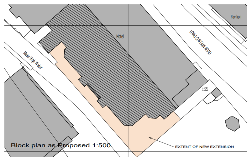
plan showing footprint of proposed extension