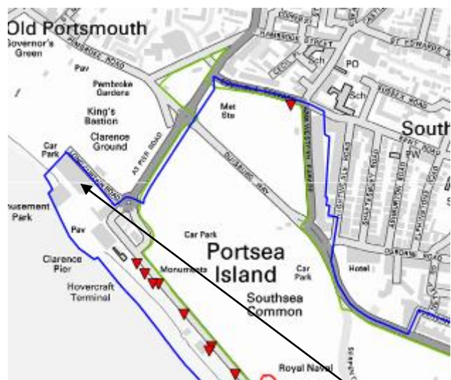
Application property Extract from Seafront Conservation Area Map