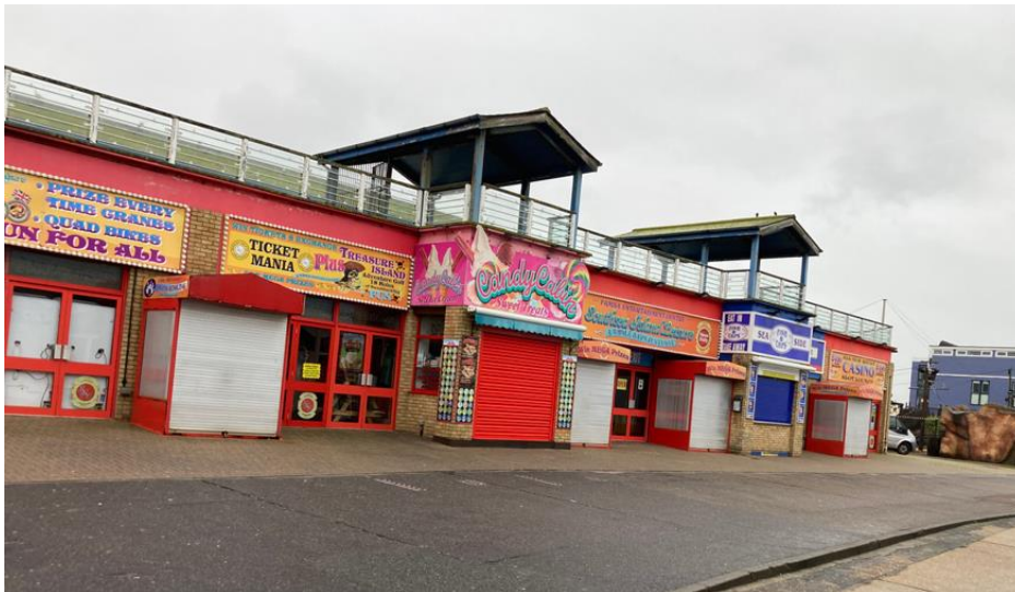
Front elevation of existing premises

with projecting shuttered reception areas and small individual stand alone kiosks.