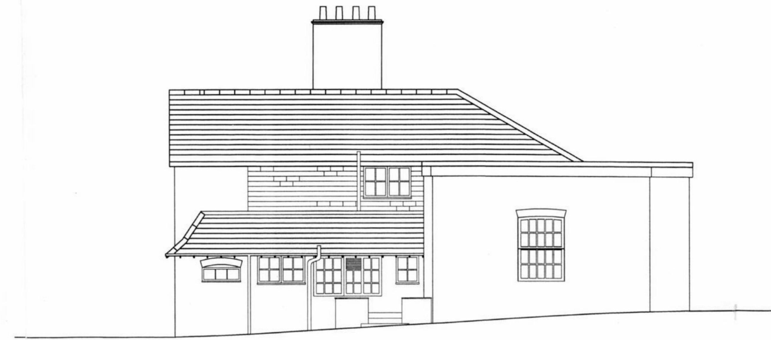
02 EXISTING NORTH WEST ELEVATION SCALE 1:100 @ A1