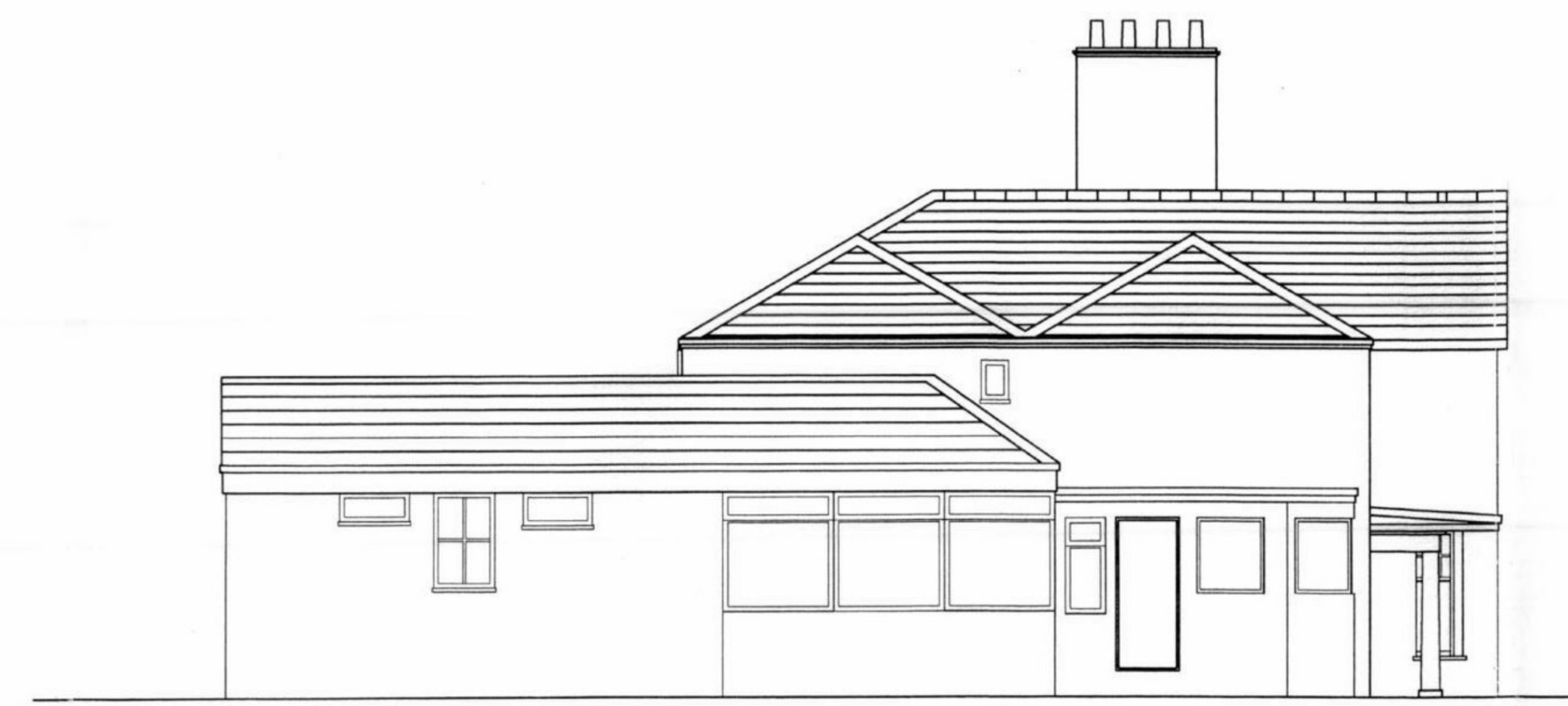
04 EXISTING SOUTH EAST ELEVATION SCALE 1:100 @ A1

This Drawing is copyright. Work to figured dimensions only check all dimensions on site. Any queries or discrepancies are to be referred to the architect for instruction before proceeding.