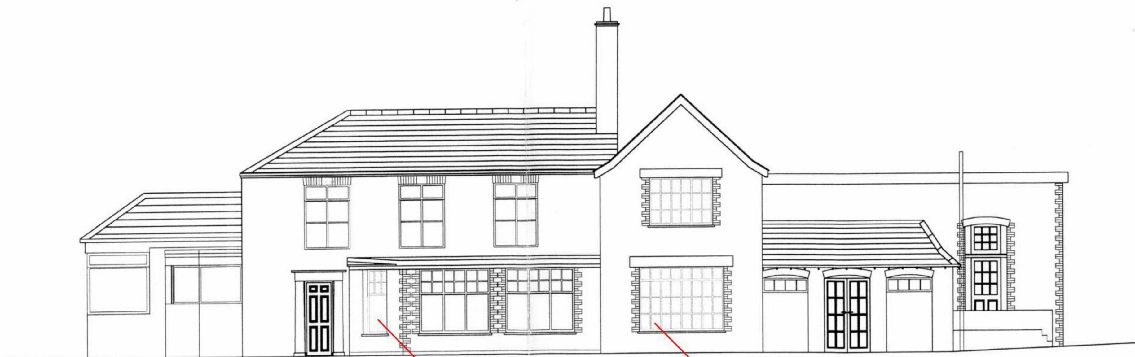
01 EXISTING NORTH EAST ELEVATION SCALE 1:100 @ A1