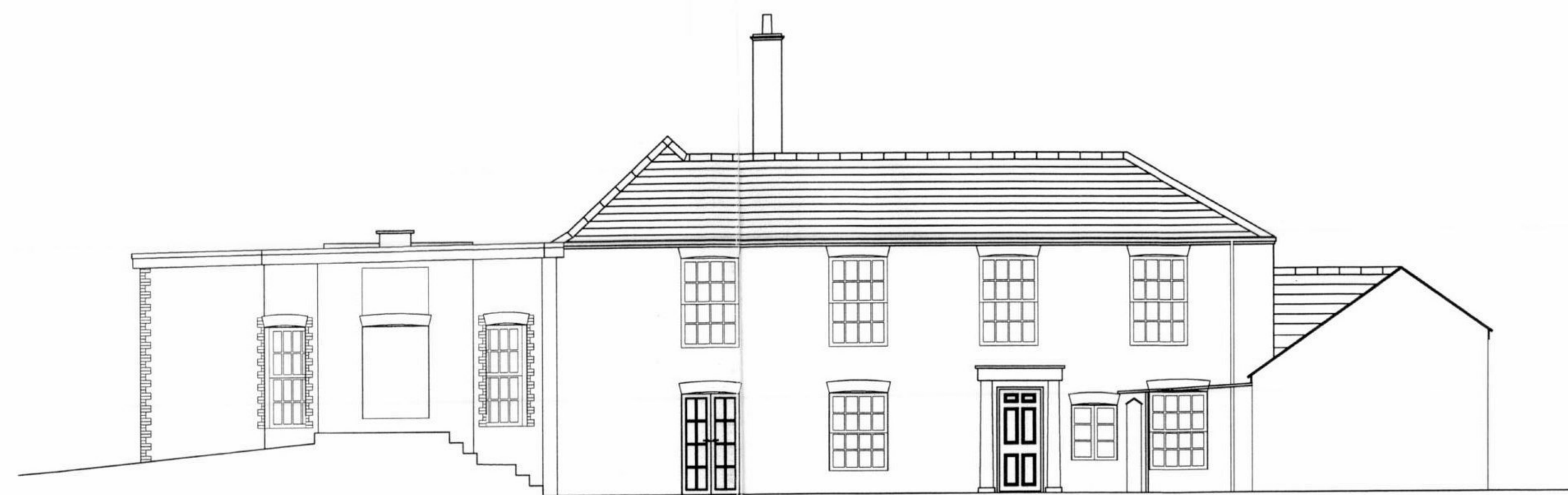
03 EXISTING SOUTH WEST ELEVATION SCALE 1:100 @ A1