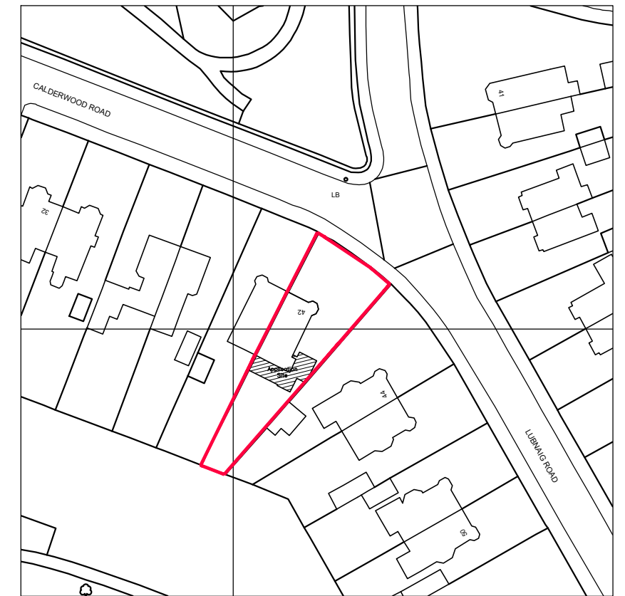
Proposed Location Plan @ 1:1250