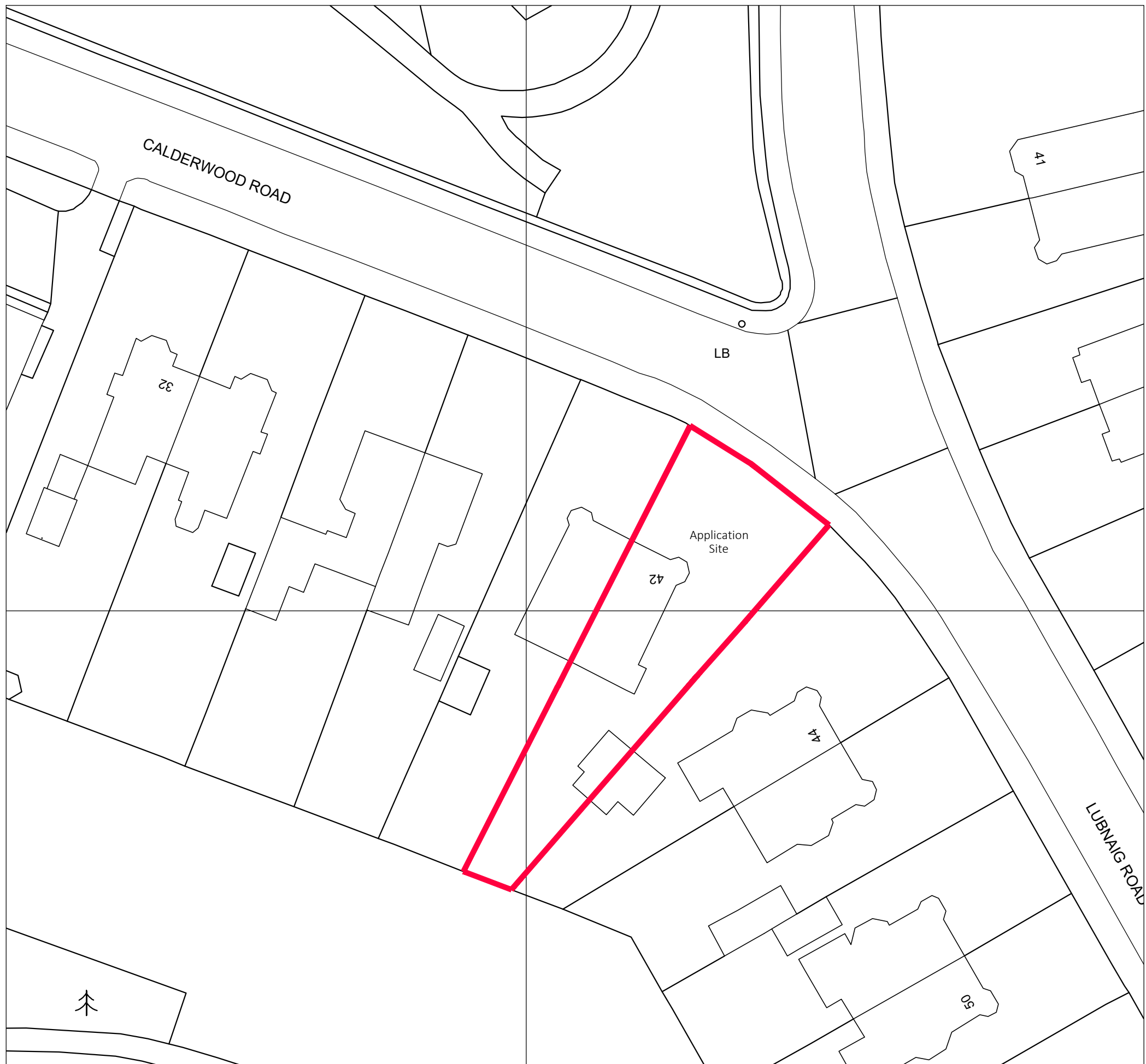
Existing Site Plan @ 1:500