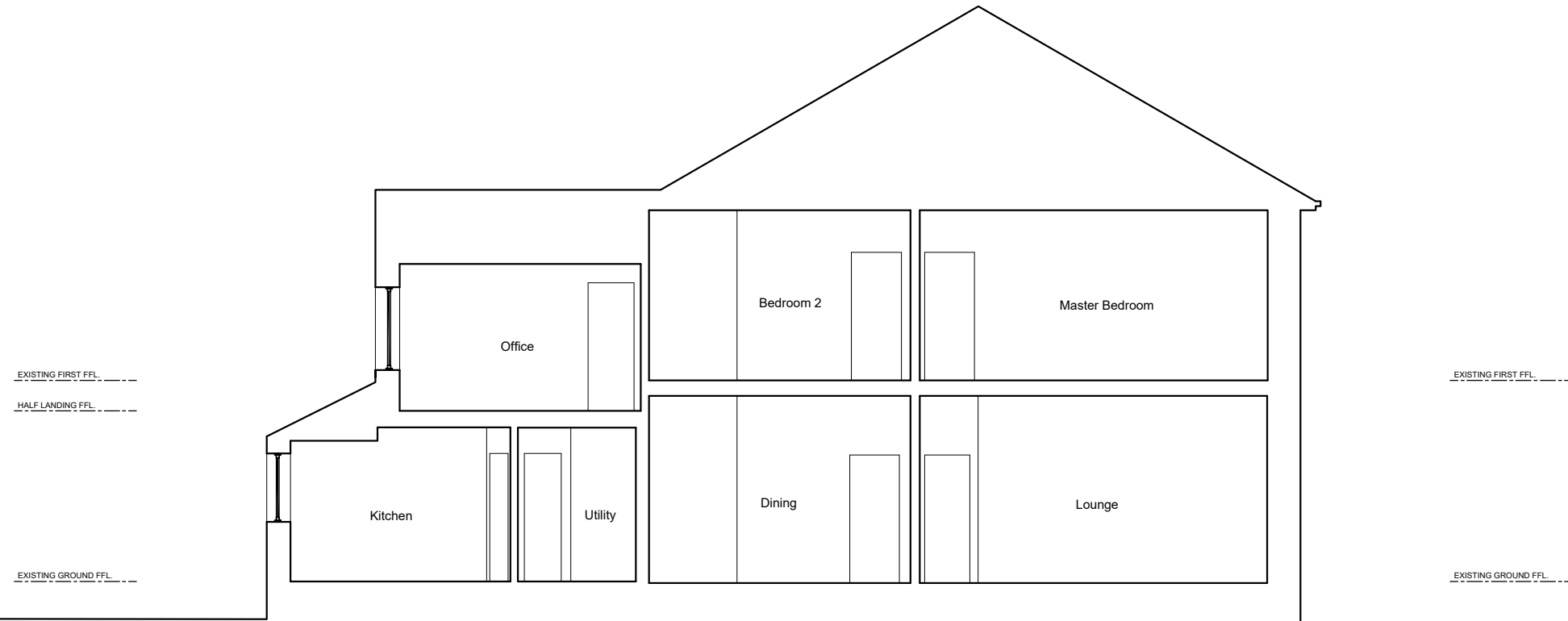
Section AA as Existing @ 1:100