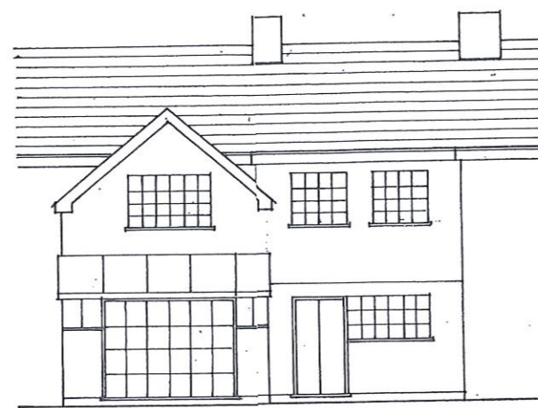
WEST ELEVATION ELEVATIONS