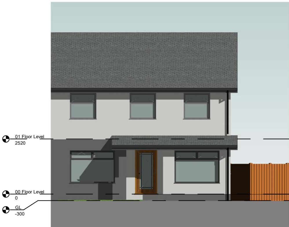
2 Proposed Front Elevation 1 : 100