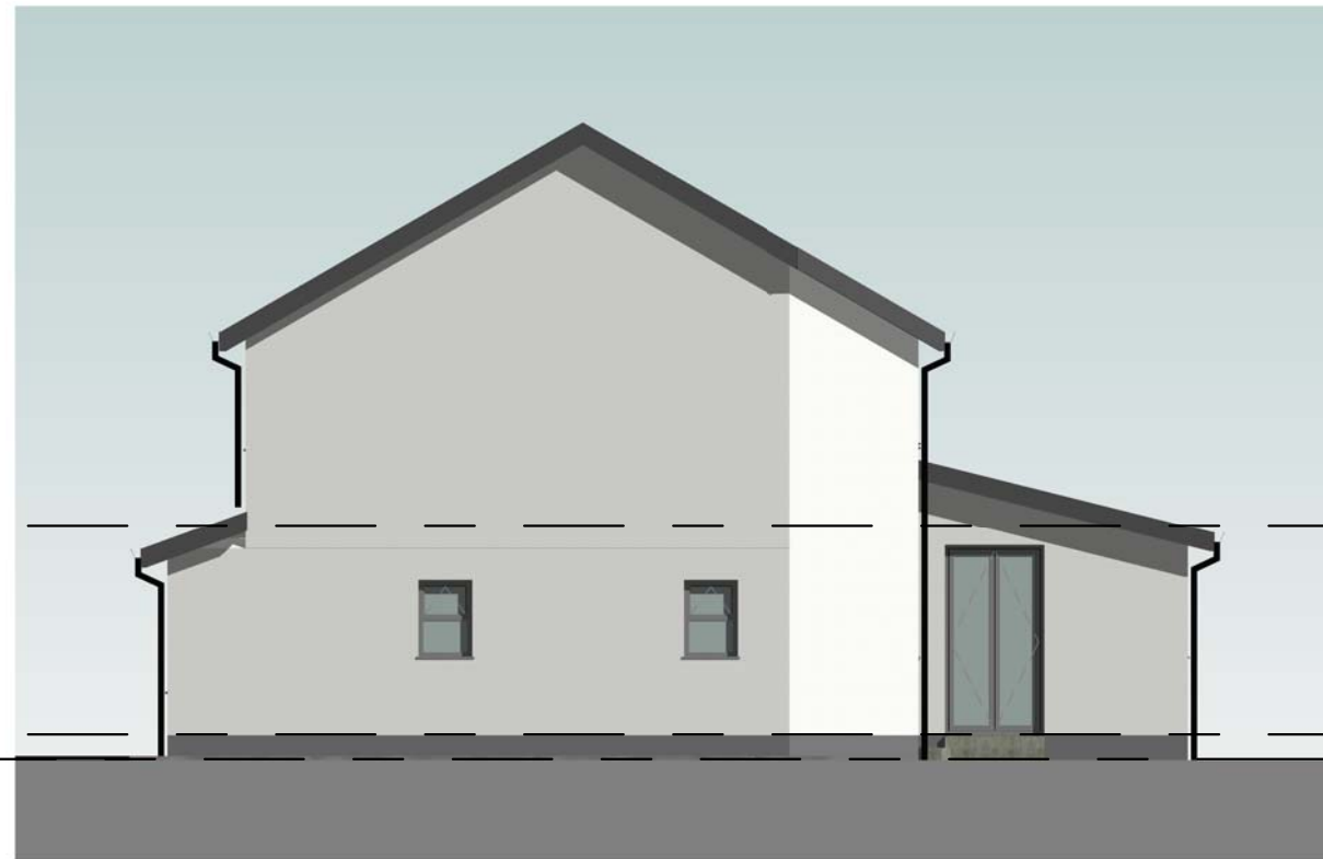
3 Proposed Side Elevation (RHS) 1 : 100