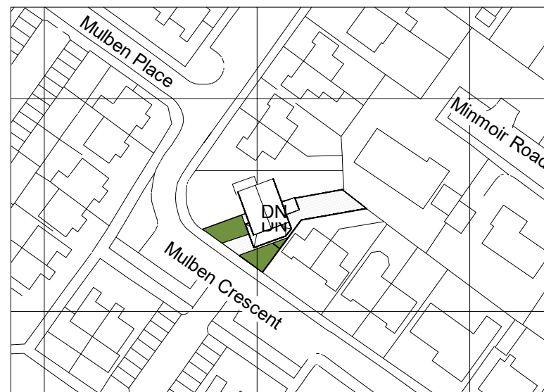
2 Location Plan 1 : 1250