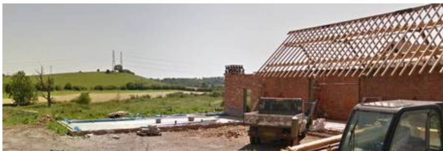
New wing at Perry Mill Barn when under construction

4.3 Perry Mill Barn is of interest mainly in relation to the former farming use of the whole site but this rear lower element has no historic fabric. The main barn at right angles to the road has however retained some historic fabric and features, including the ventilation pattern and cart entrance.