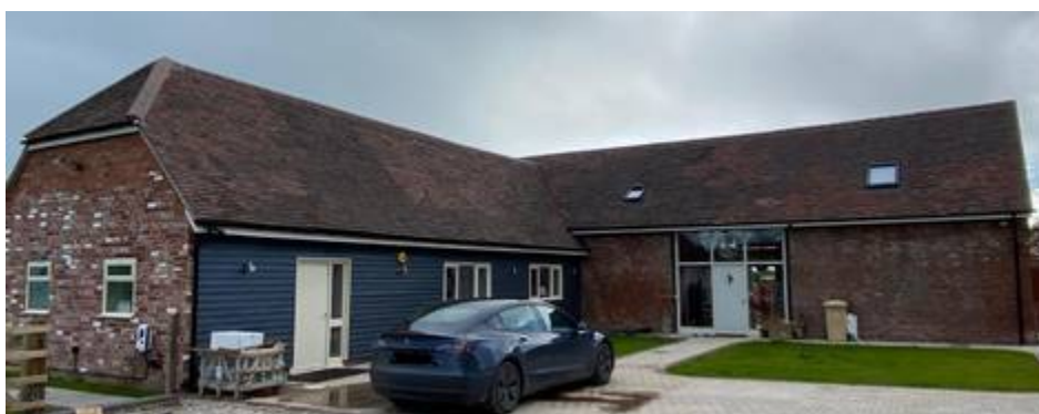
Perry Mill Barn-completed conversion