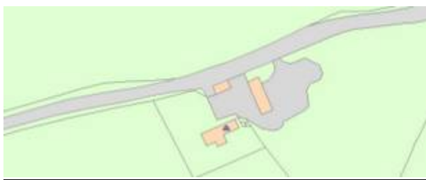
Listed Building marked by blue triangle

Crown Copyright All Rights reserved Licence No 100053805