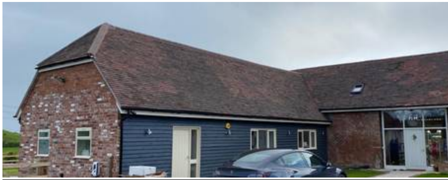
Rear wing of Perry Mill Barn