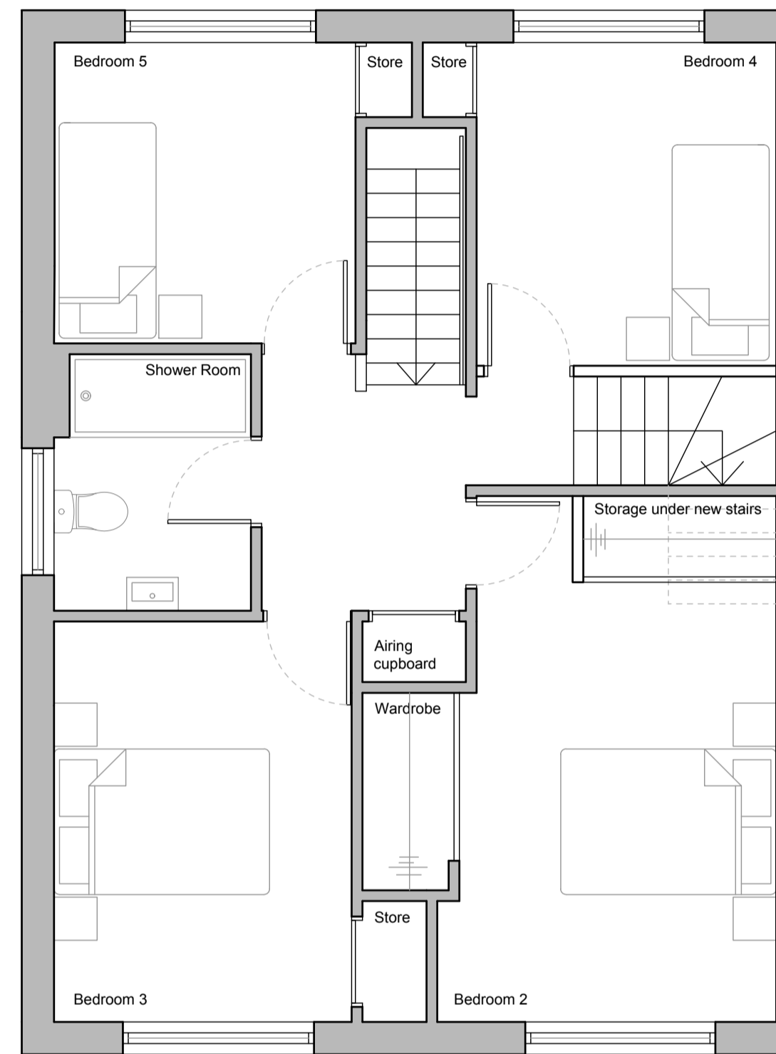
Proposed First Floor Plan Scale 1:50