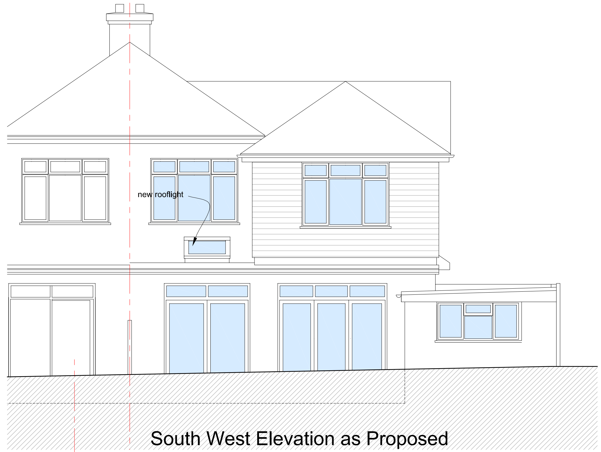
South West Elevation as Proposed scale 1:50 @ A1