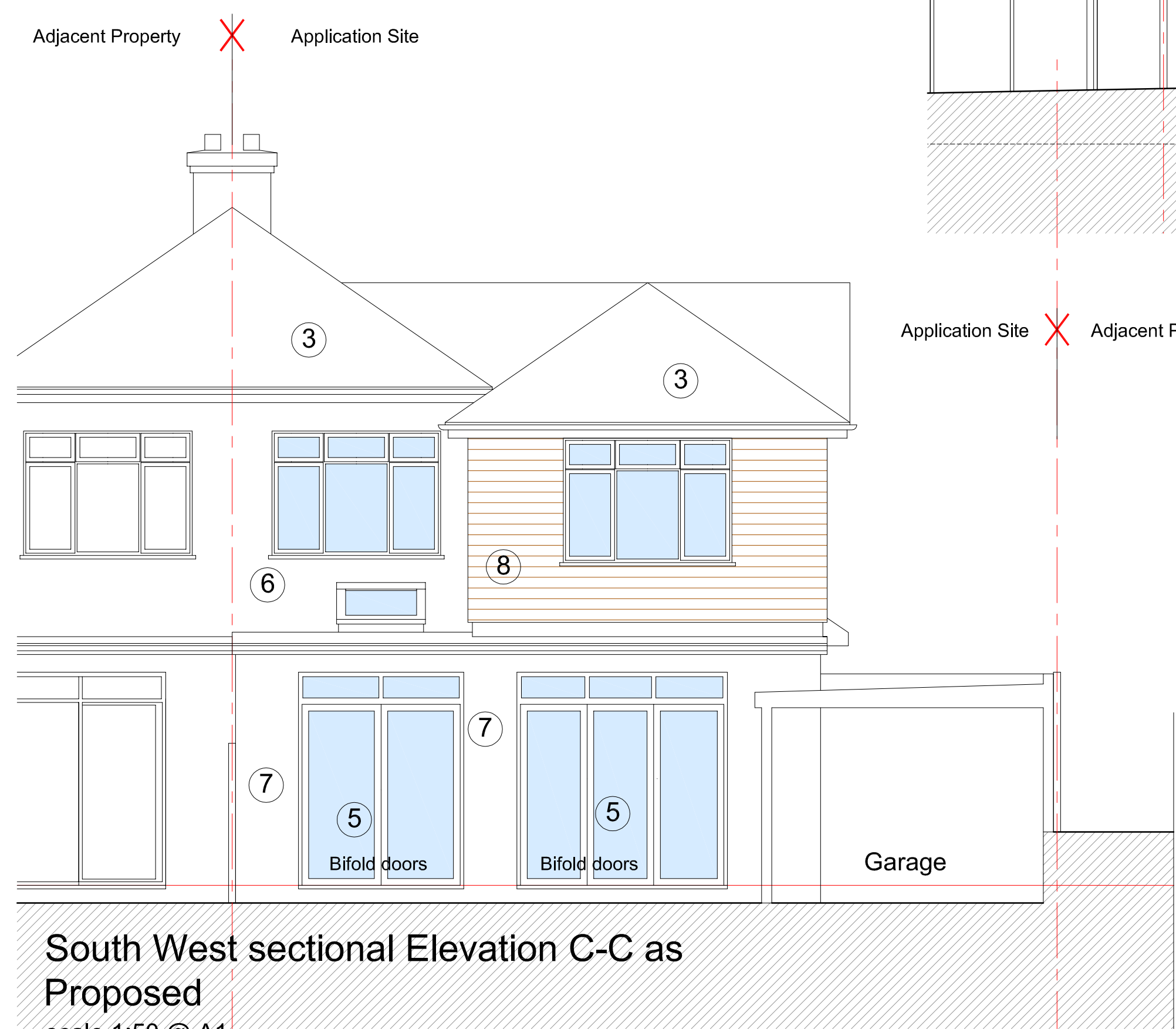
South West sectional Elevation C-C as Proposed scale 1:50 @ A1