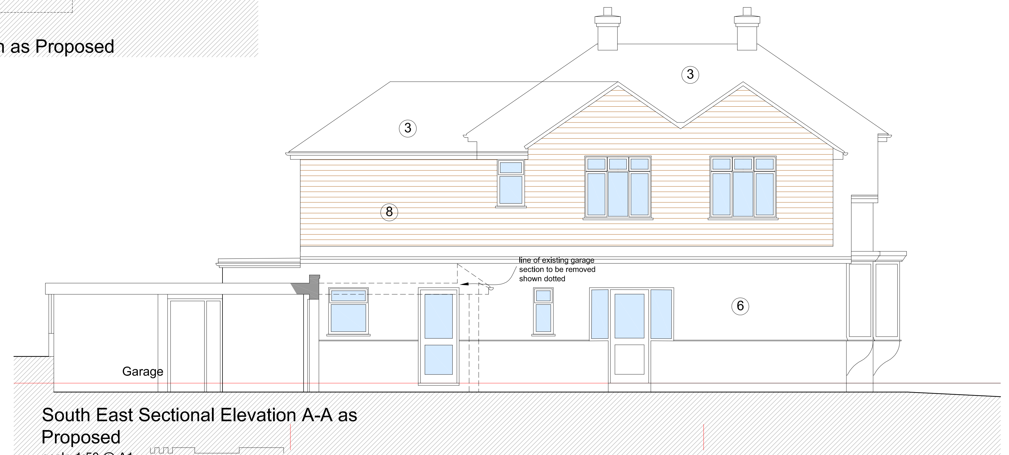
South East Sectional Elevation A-A as Proposed scale 1:50 @ A1