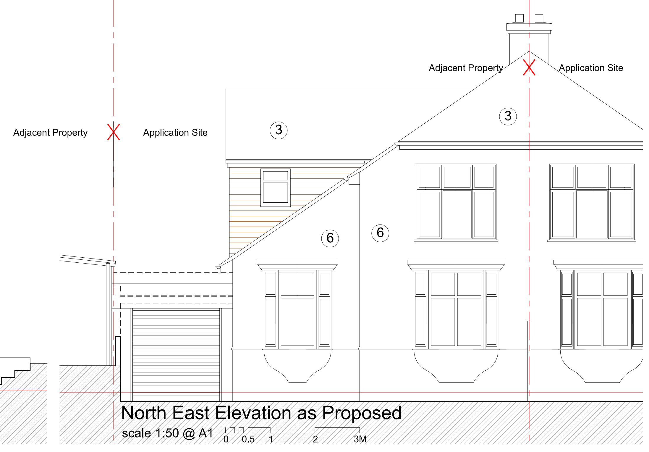
North East Elevation as Proposed scale 1:50 @ A1

rev: A date: 21.05.2021 notes: Planning project: 16 Little Buckland Avenue Maidstone PROPOSED ADDITIONS AND ALTERATIONS client: Mr & Mrs Mullen drawing: Proposed Elevations scale: As shown@A1 date: May 2021 drawn: dpt pt design studio tel 01622 676493 email: ptrigg1@btinternet.com