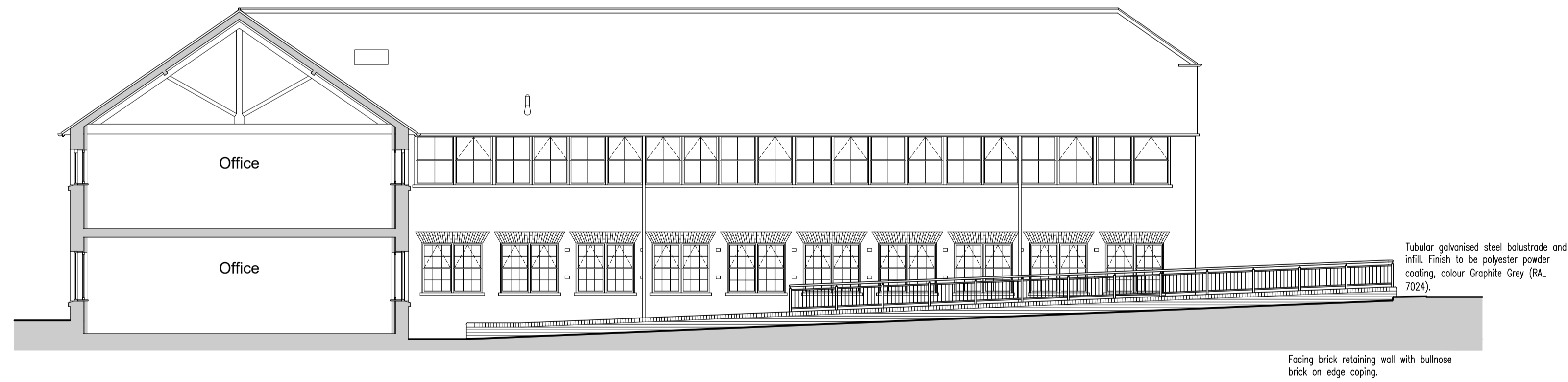
Car Park Sectional Elevation

Notes: - Do not scale. - The contractor is responsible for checking dimensions, tolerances and references. Report all discrepancies to David Bellamy Consulting Limited before proceeding with the works. - Where an item is covered by drawings to different scales the larger scale drawing is to be worked to. COPYRIGHT: David Bellamy Consulting Limited own the copyright to this drawing. Their written consent must be obtained before this drawing is copied or used for any purpose other than the one for which it was supplied.