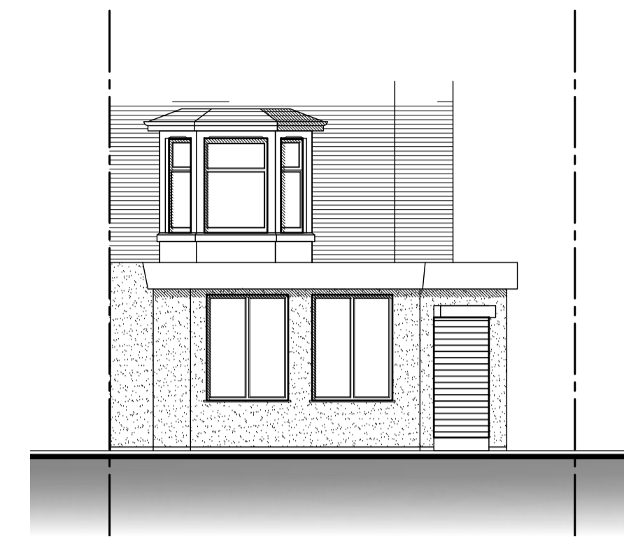
EXISTING SIDE (SOUTH) ELEVATION 1:100