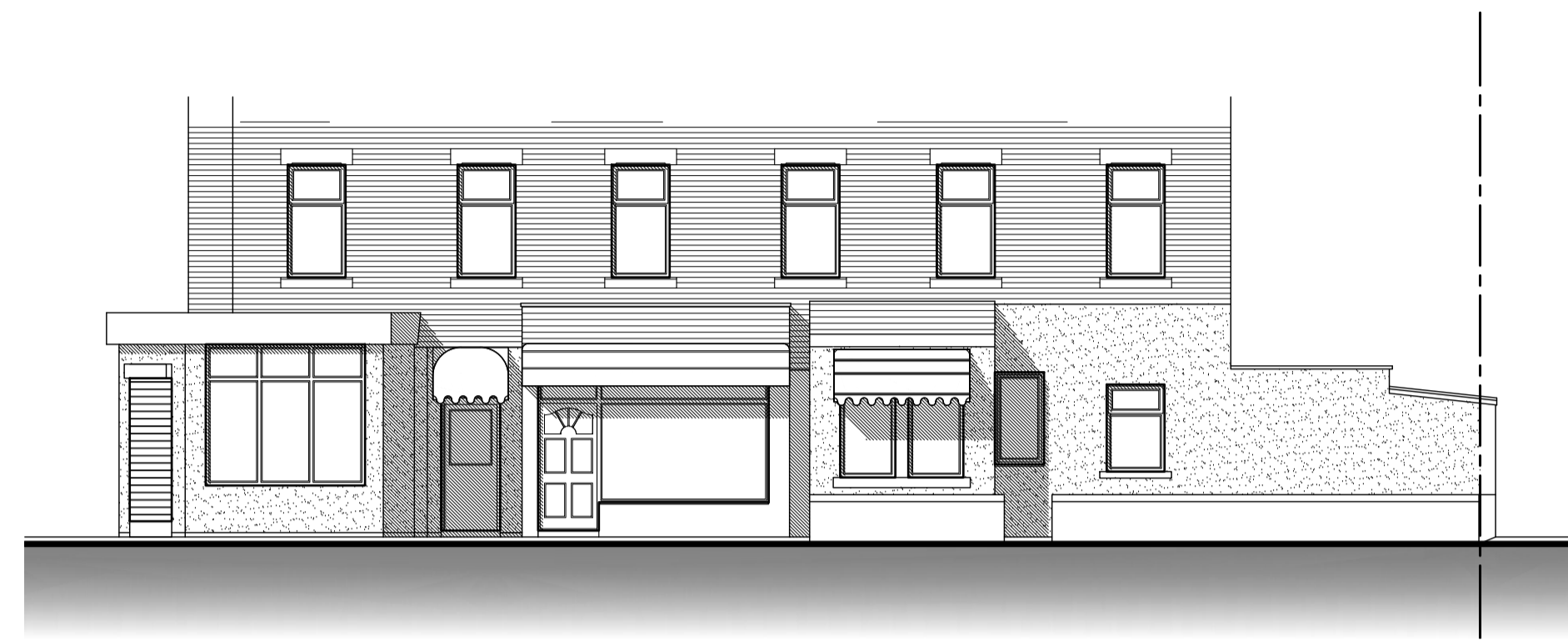
EXISTING FRONT (EAST) ELEVATION 1:100

Drawings for planning purposes only, all dimensions to be checked and verified by the contractor prior to work commencing on site. Contractor to ensure all materials are to Local Authority approval and to take into account everything necessary for the proper execution of the works.