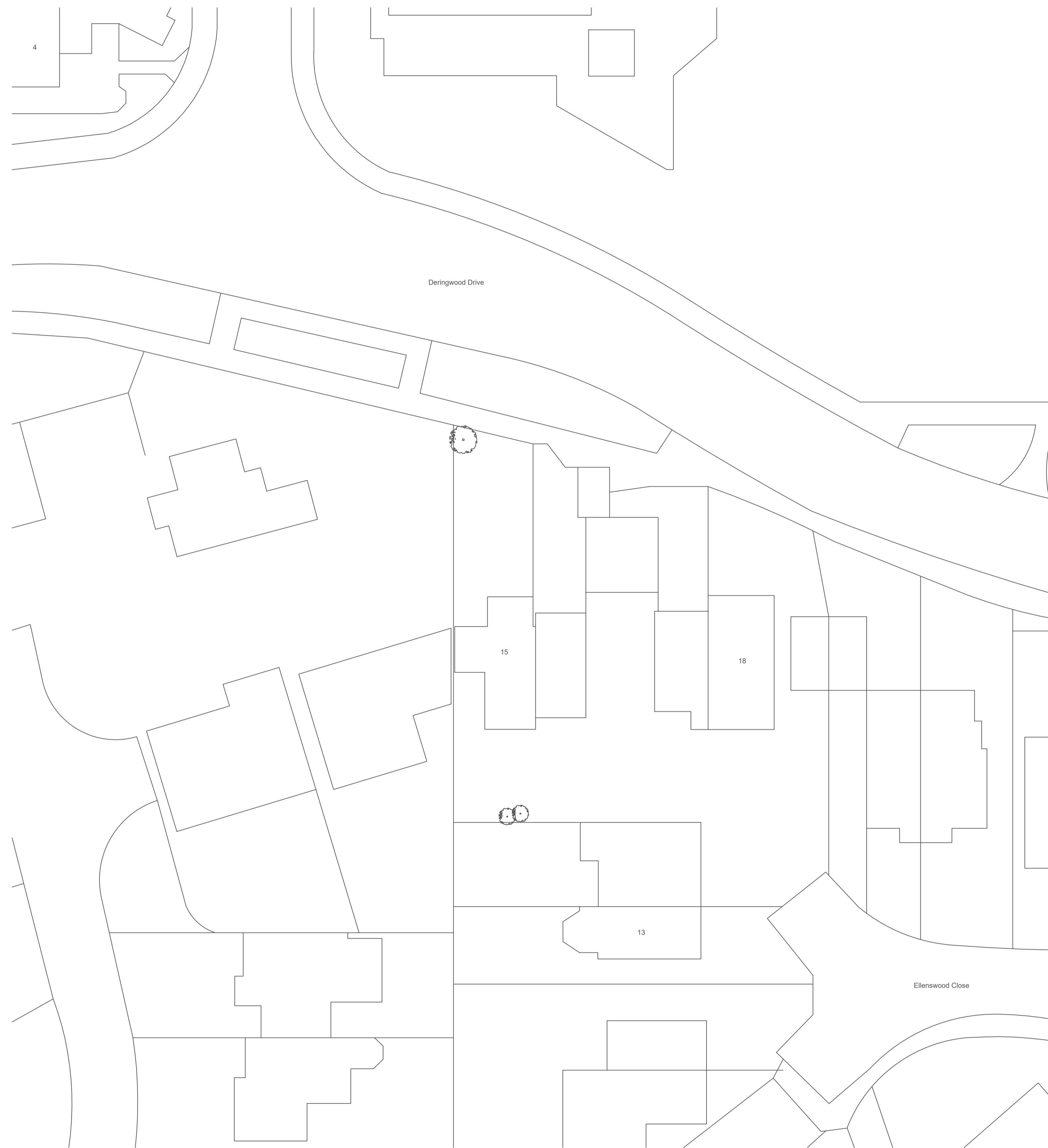
Existing Block Plan Scale 1:200