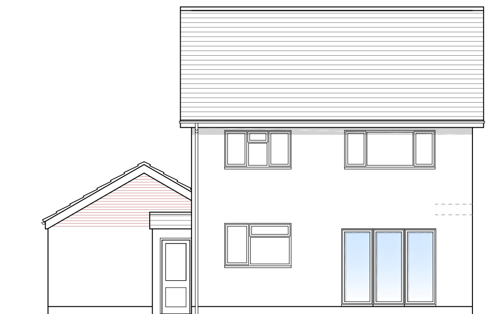
REAR ELEVATION AS PROPOSED | Scale 1:100