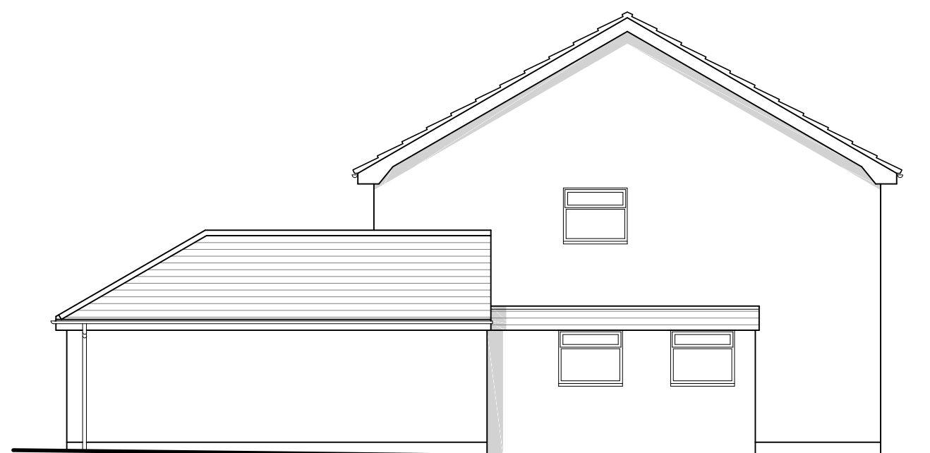
SIDE ELEVATION AS PROPOSED | Scale 1:100