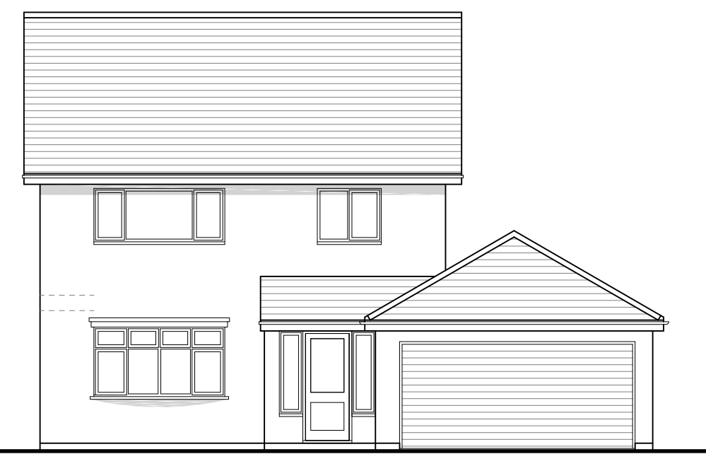
FRONT ELEVATION AS PROPOSED | Scale 1:100