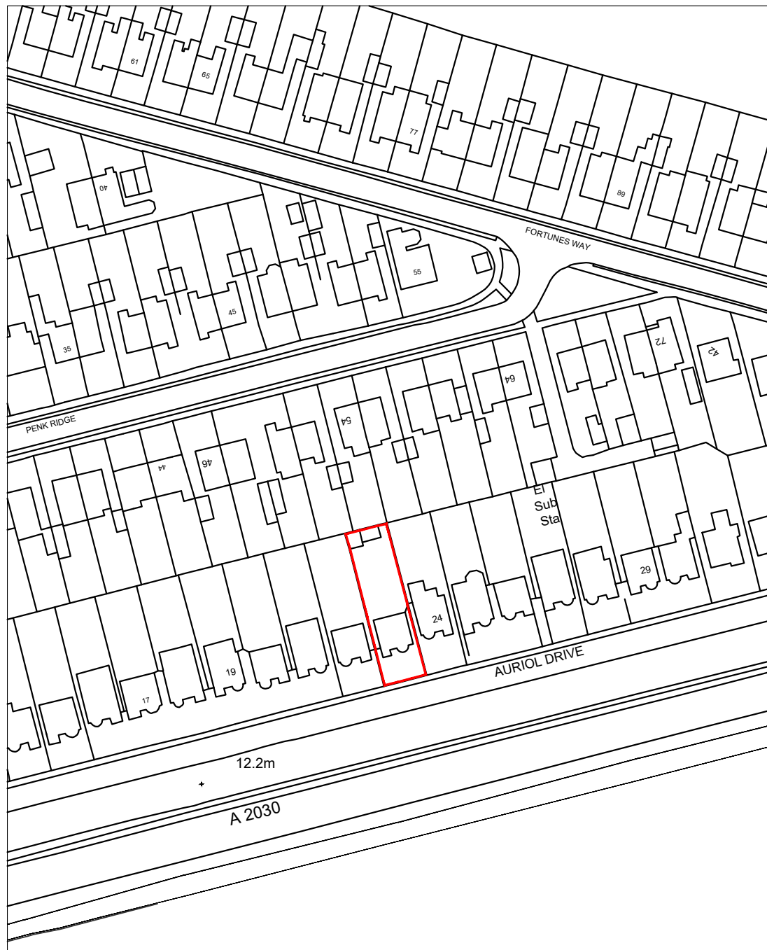
Location Plan: 1:1250