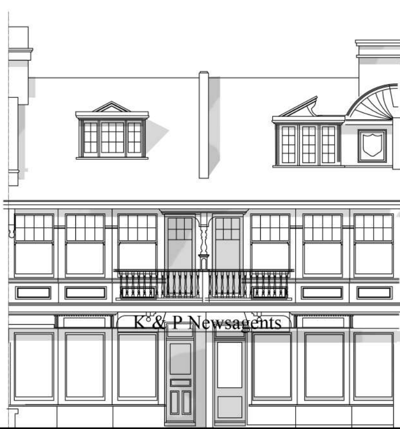
Proposed Front Elevation - Scale 1:00