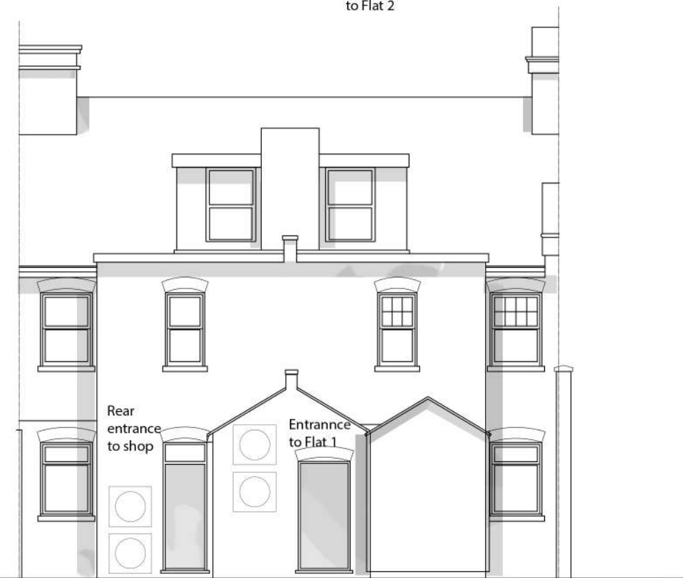
Proposed Rear Elevation - Scale 1:00