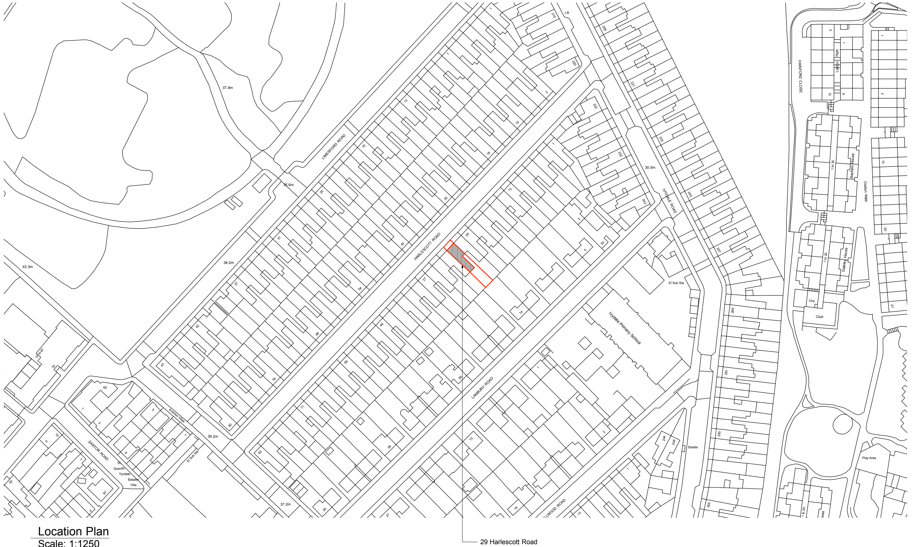
Location Plan Scale: 1:1250