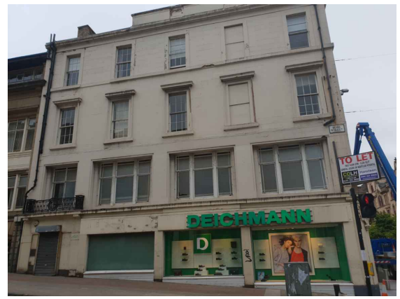
Photo 4 - Rose Street Elevation