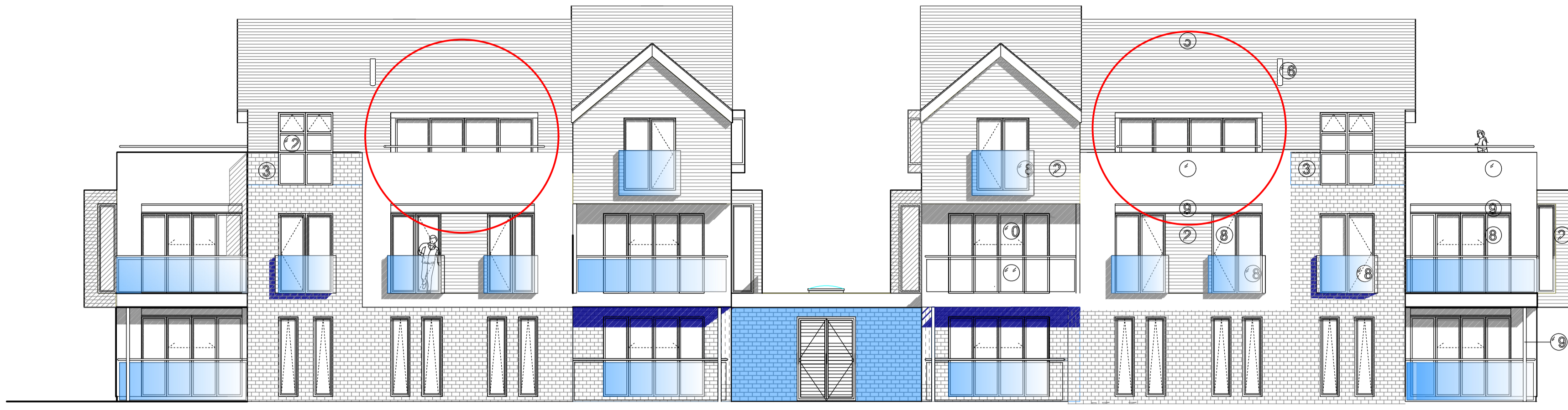
Existing North East (Front Facing) Elevation Scale 1:100 1:100 2m 0 2m 4m

Notes: Do not rely solely on drawing dimensions.