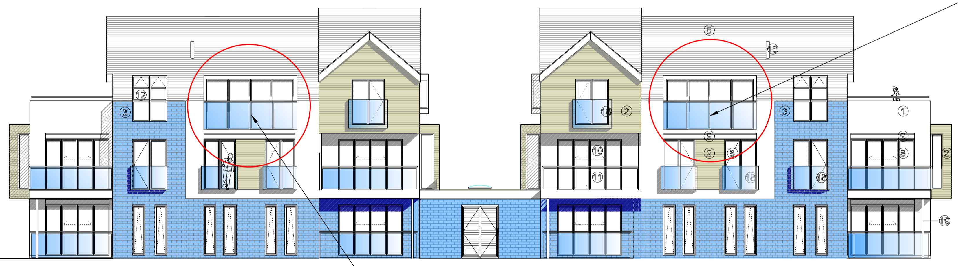
Proposed North East (Front Facing) Elevation Scale 1:100 1:100 2m 0 2m 4m