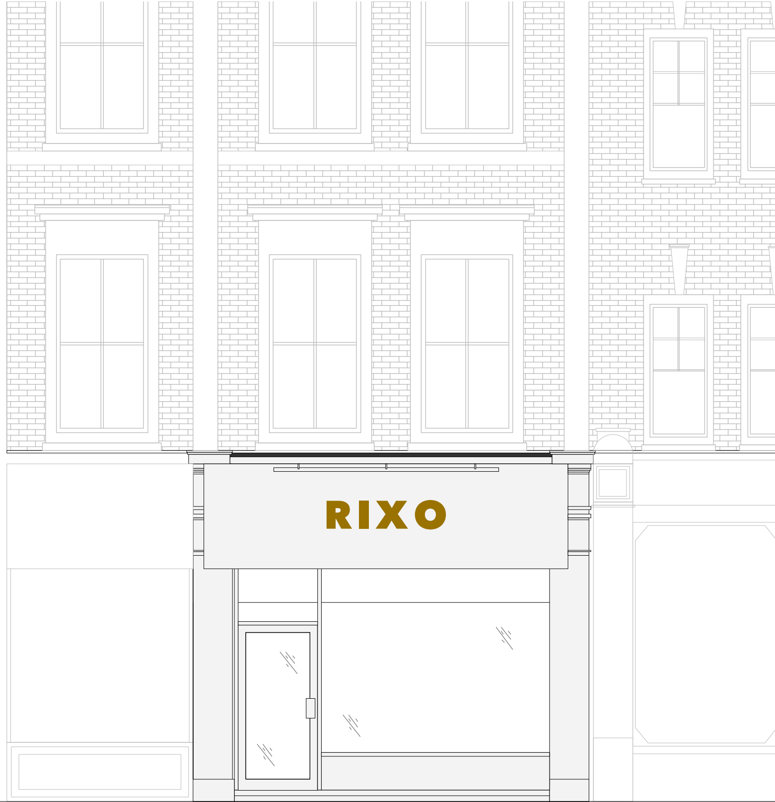
1 EXISTING SHOPFRONT ELEVATION Scale: 1:50