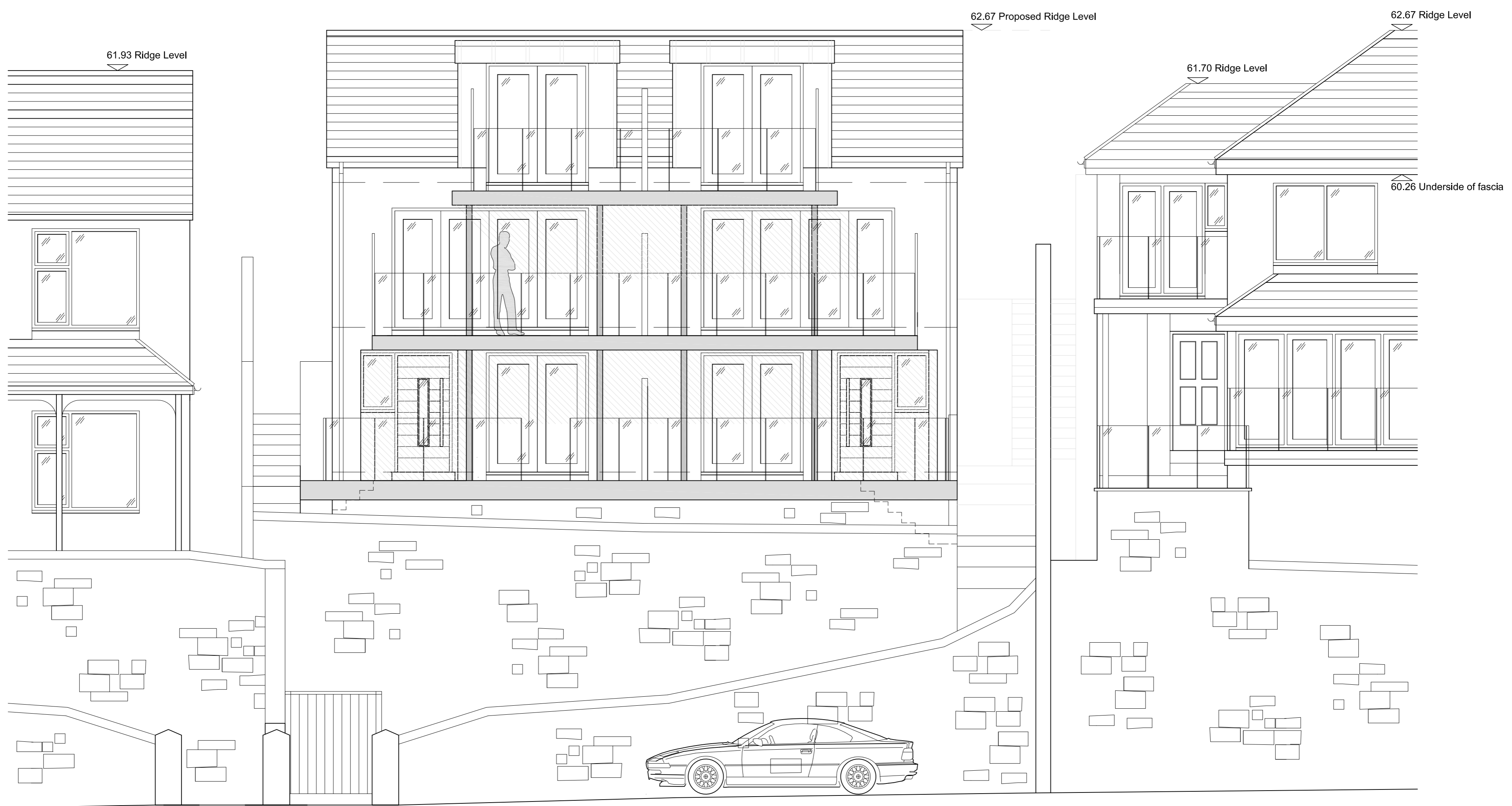
Proposed Front (West) Elevation 1:50