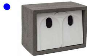
Vivara Pro WoodStone House Sparrow Integrated Nest Box

Partneriaeth Garner Southall Partnership