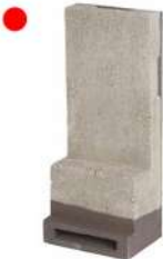
Vivara Pro Build-in WoodStone Bat Box