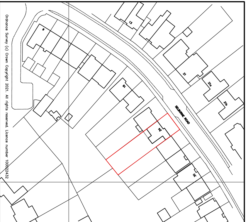
Site Location Plan scale 1:1250

Cadscapes Ltd. accept no responsibility for the construction in the vicinity of property boundaries and party walls. Clients should be aware of the principles of the 'Party Wall Act 1996' and undertake relevant agreements before construction commences.