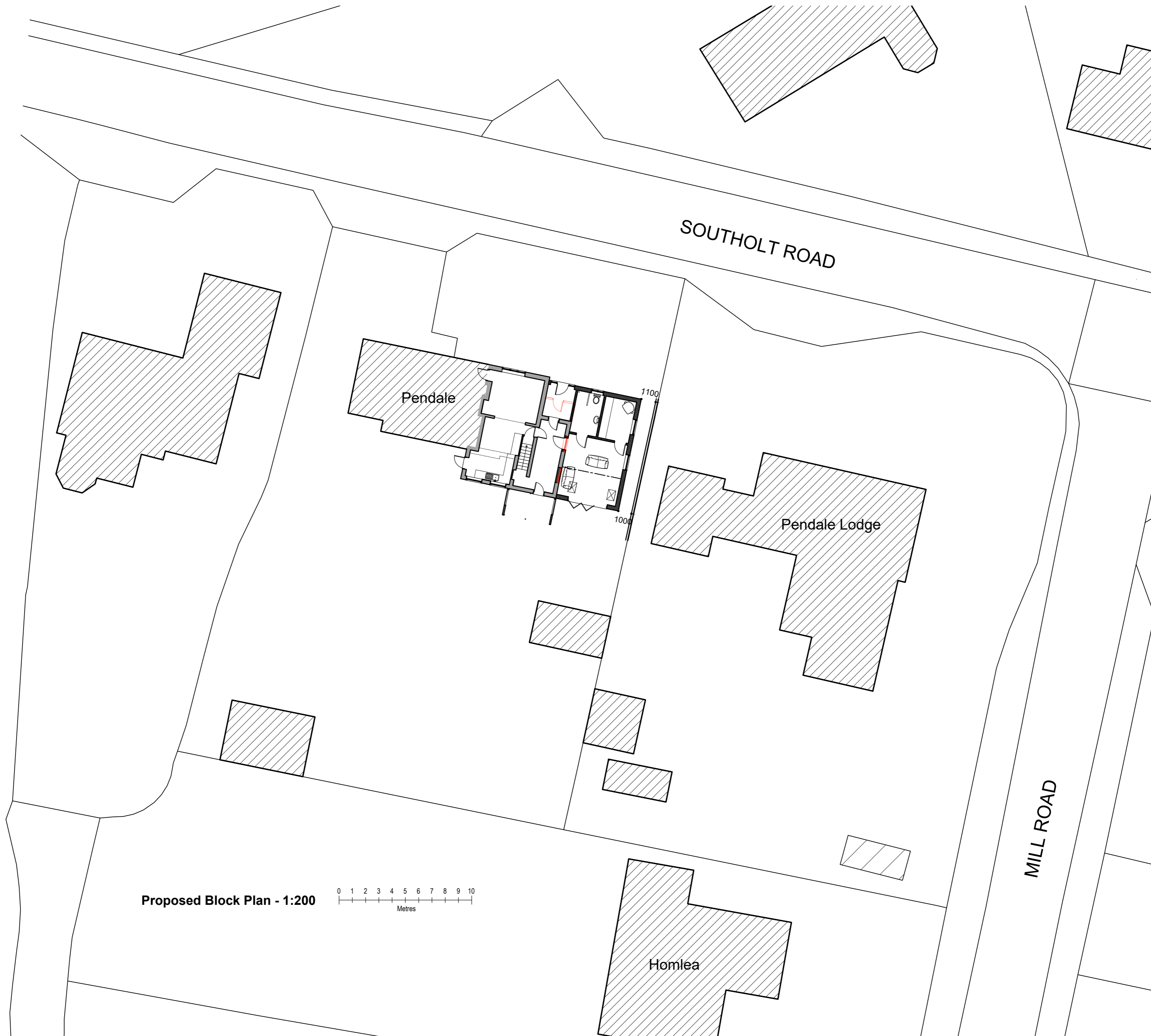
Proposed Block Plan - 1:200