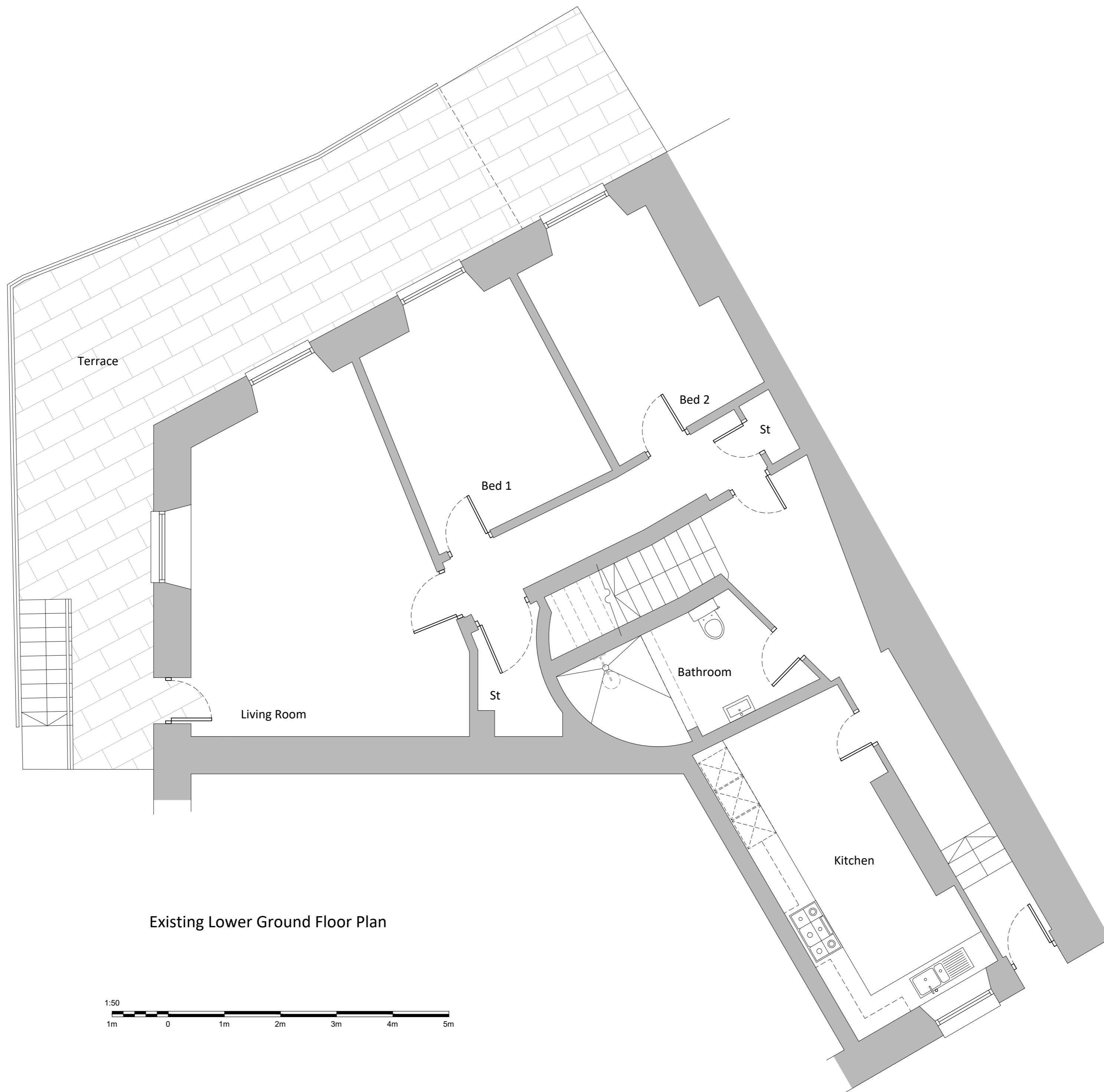
Existing Lower Ground Floor Plan