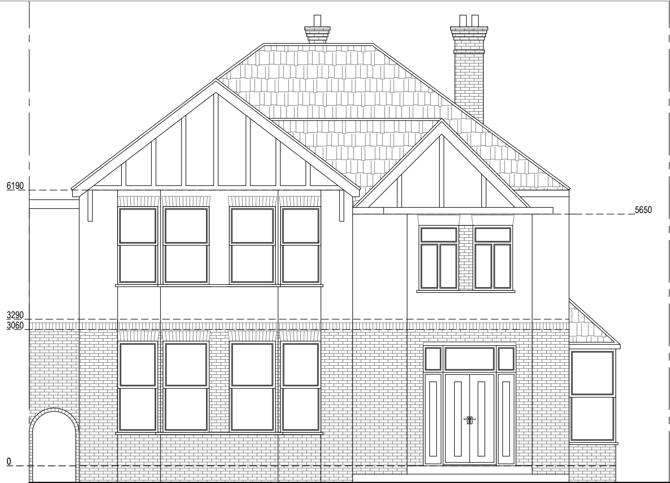
Proposed Northwest Elevation Scale 1:50