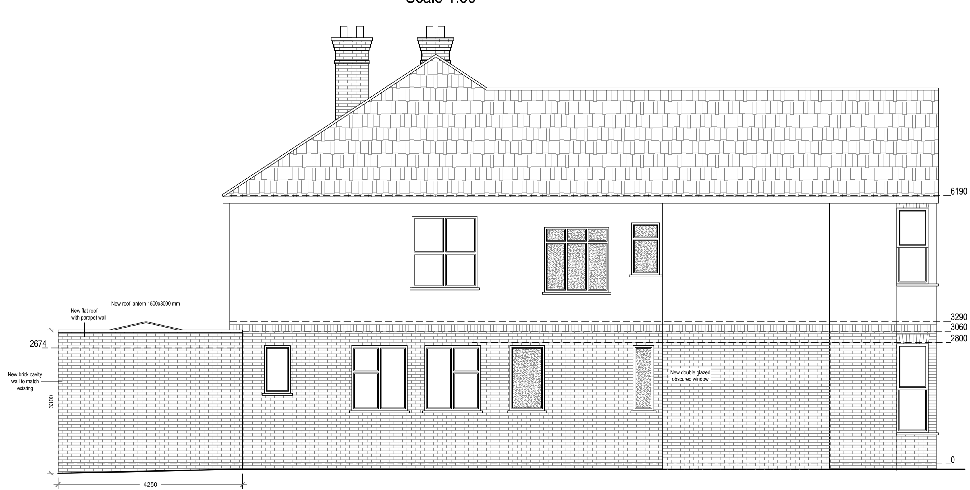
Proposed Northeast Elevation Scale 1:50