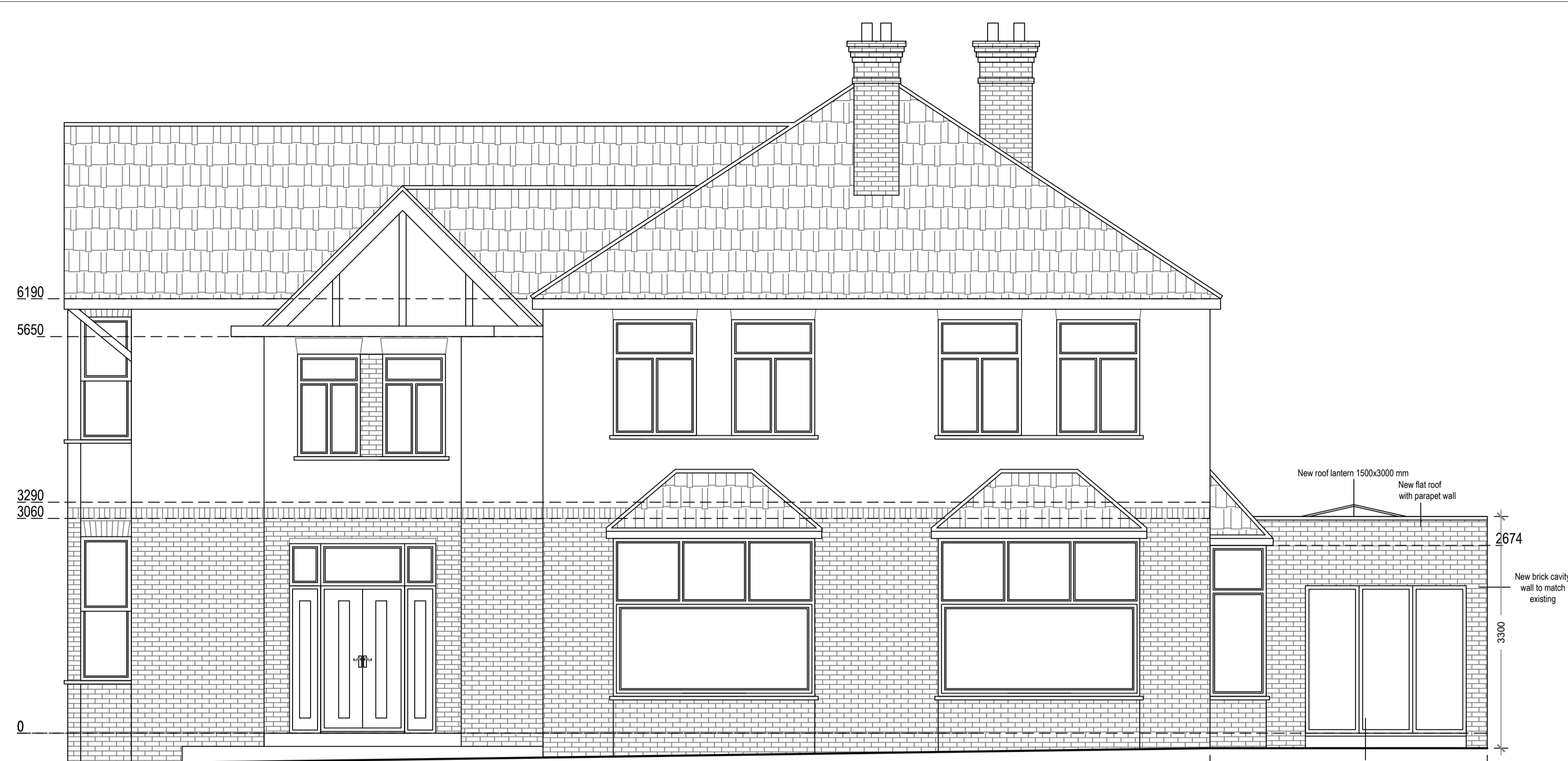
Proposed Southwest Elevation Scale 1:50