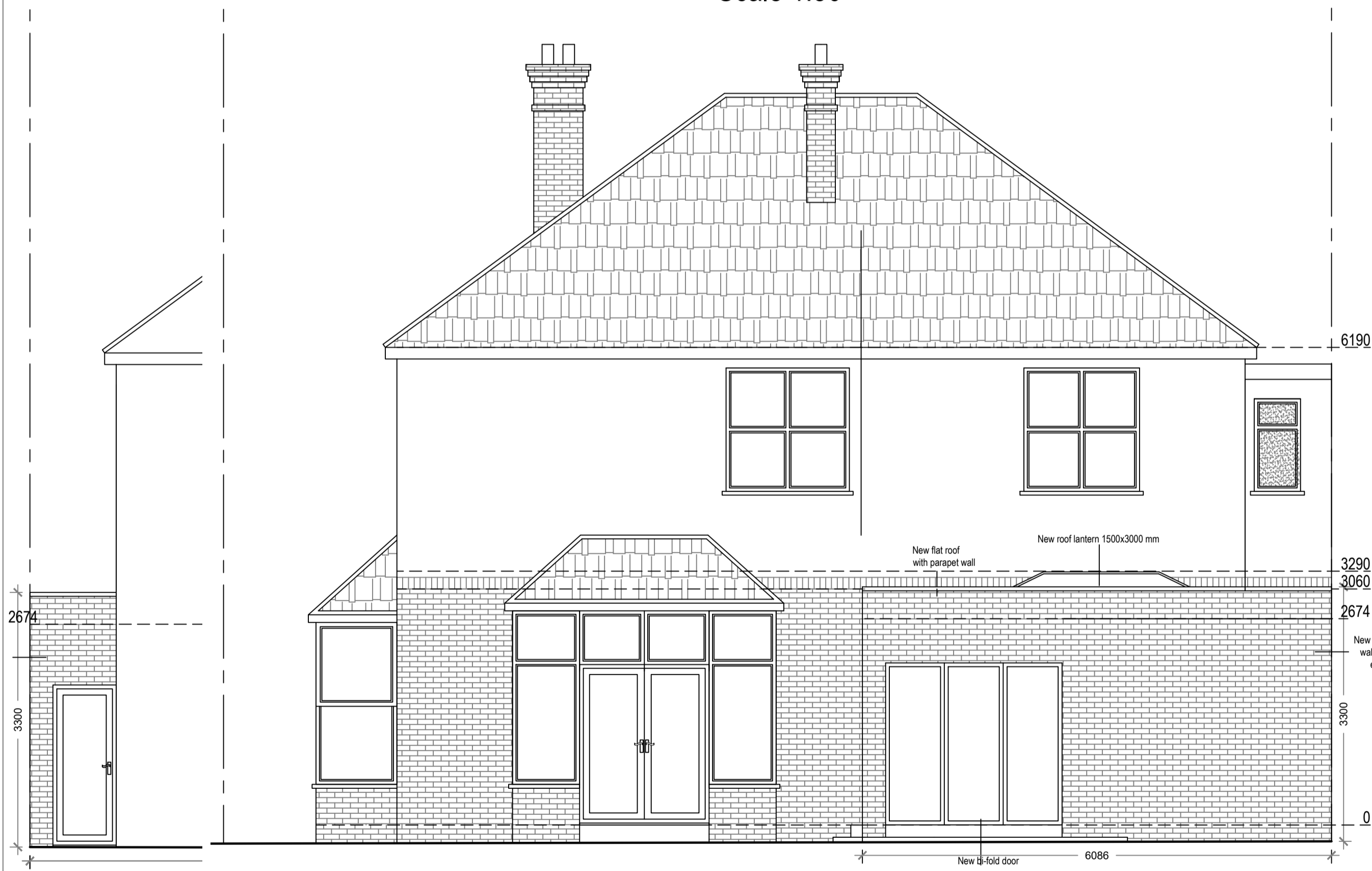
Proposed Side Elevation to ground floor extension Scale 1:50