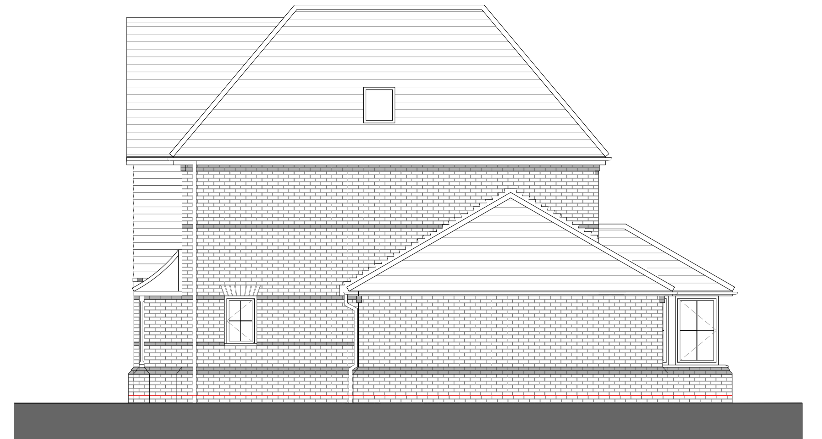
SIDE (SOUTH) ELEVATION