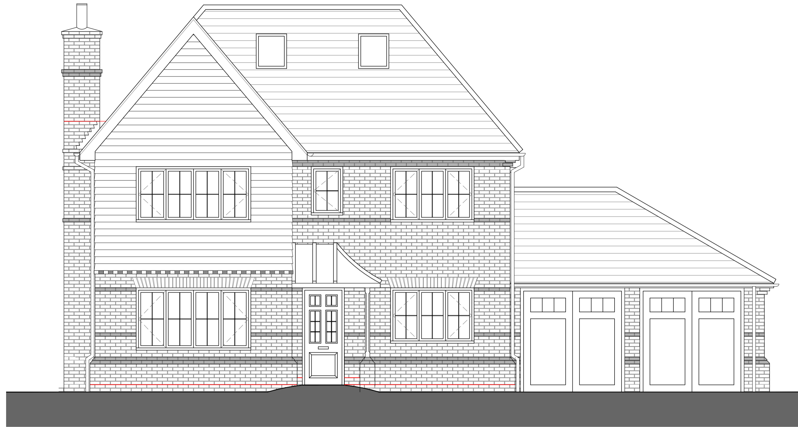
FRONT (WEST) ELEVATION