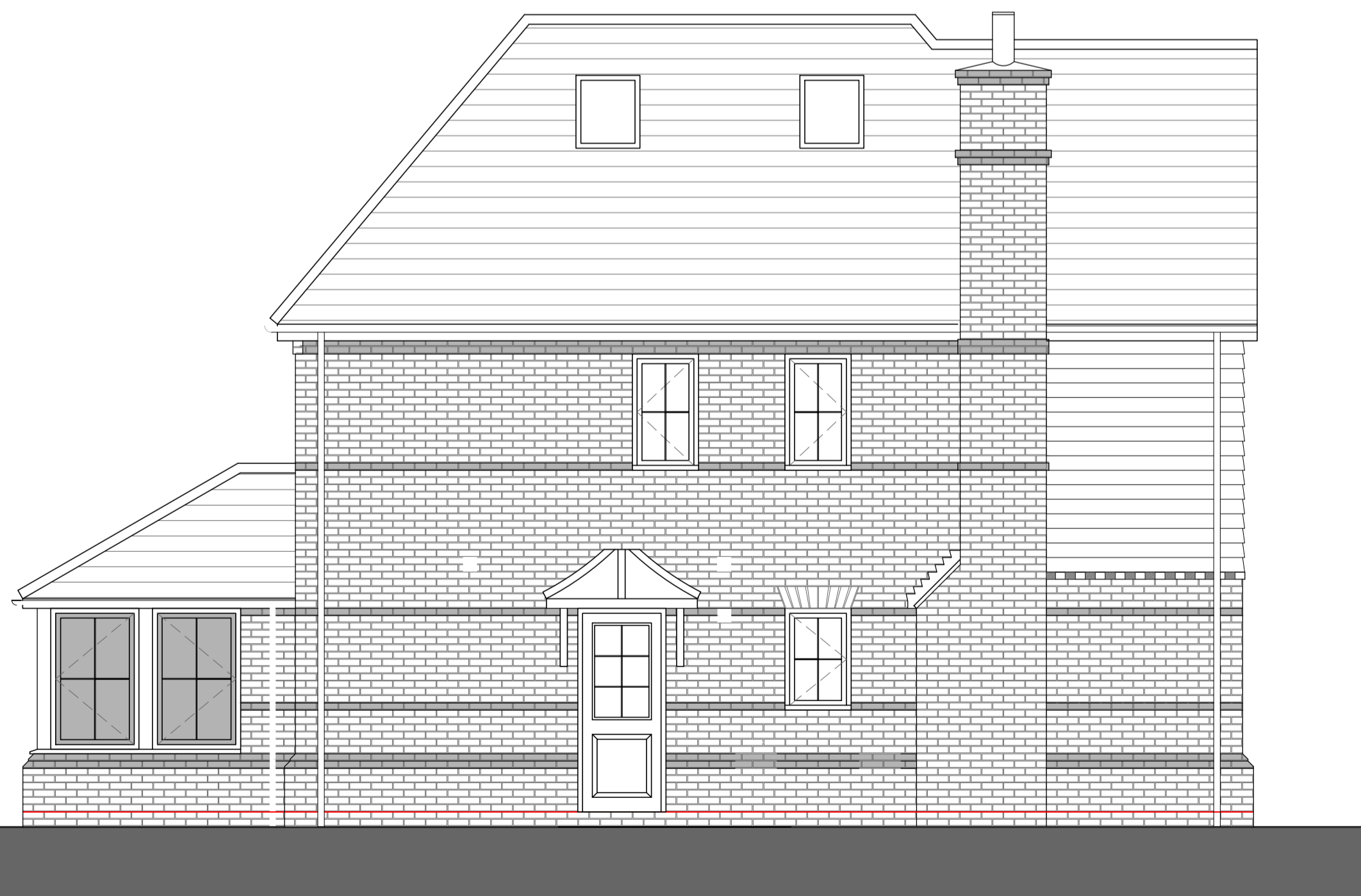
SIDE (NORTH) ELEVATION