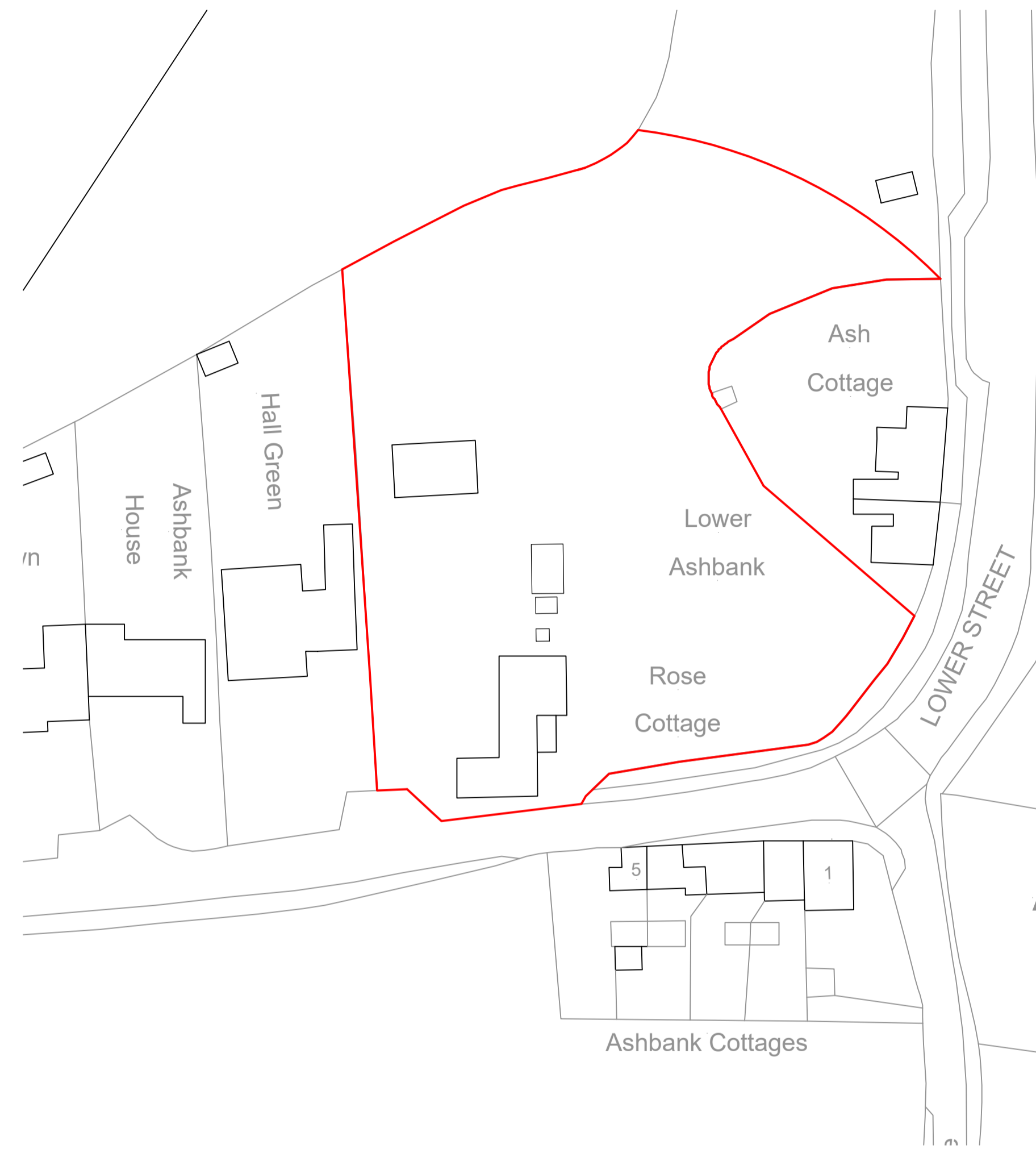
Block plan 1:500