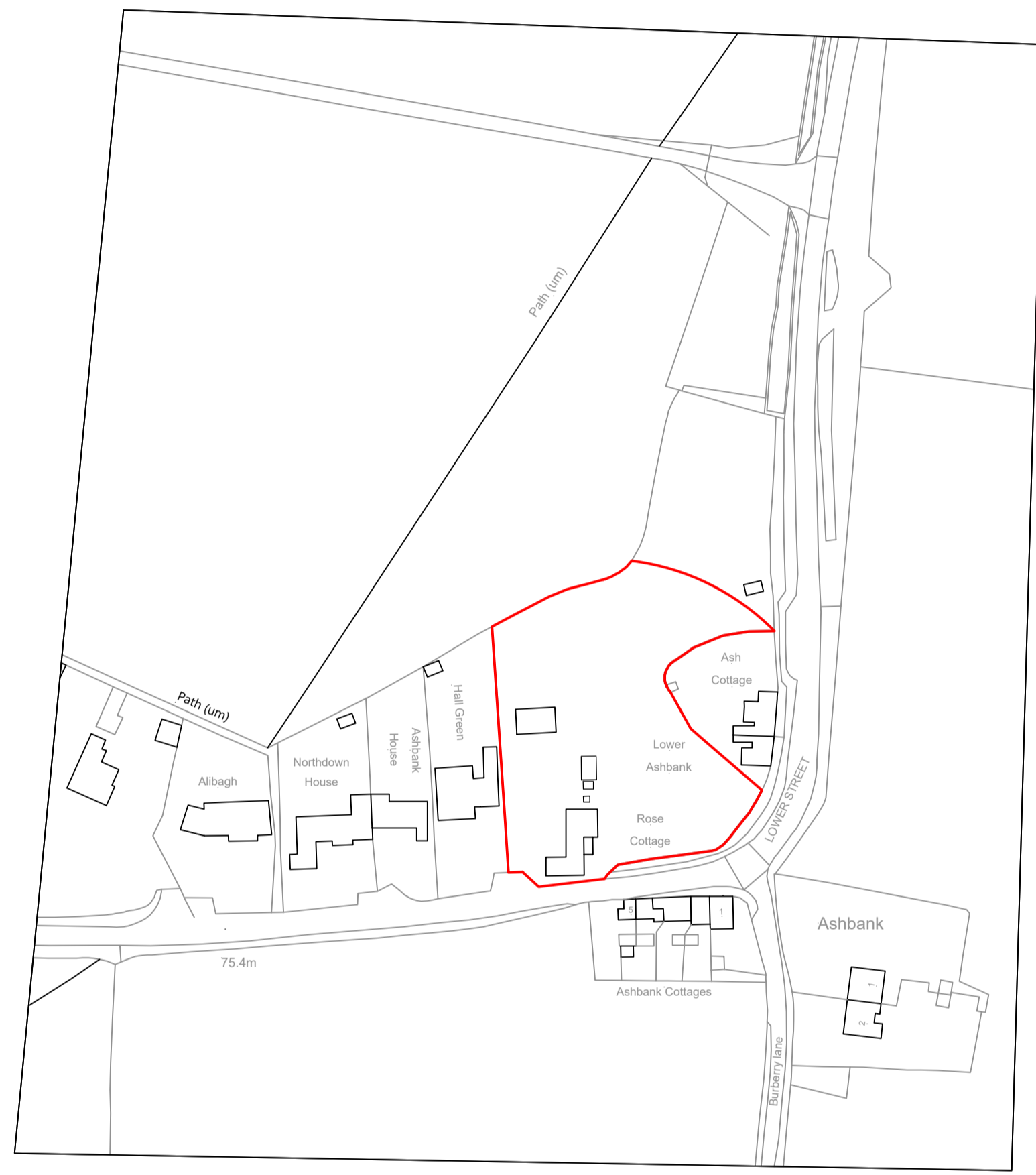
Site location plan 1:1250