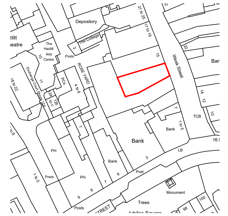
2 SITE LOCATION PLAN Scale: 1:1250 @ A3