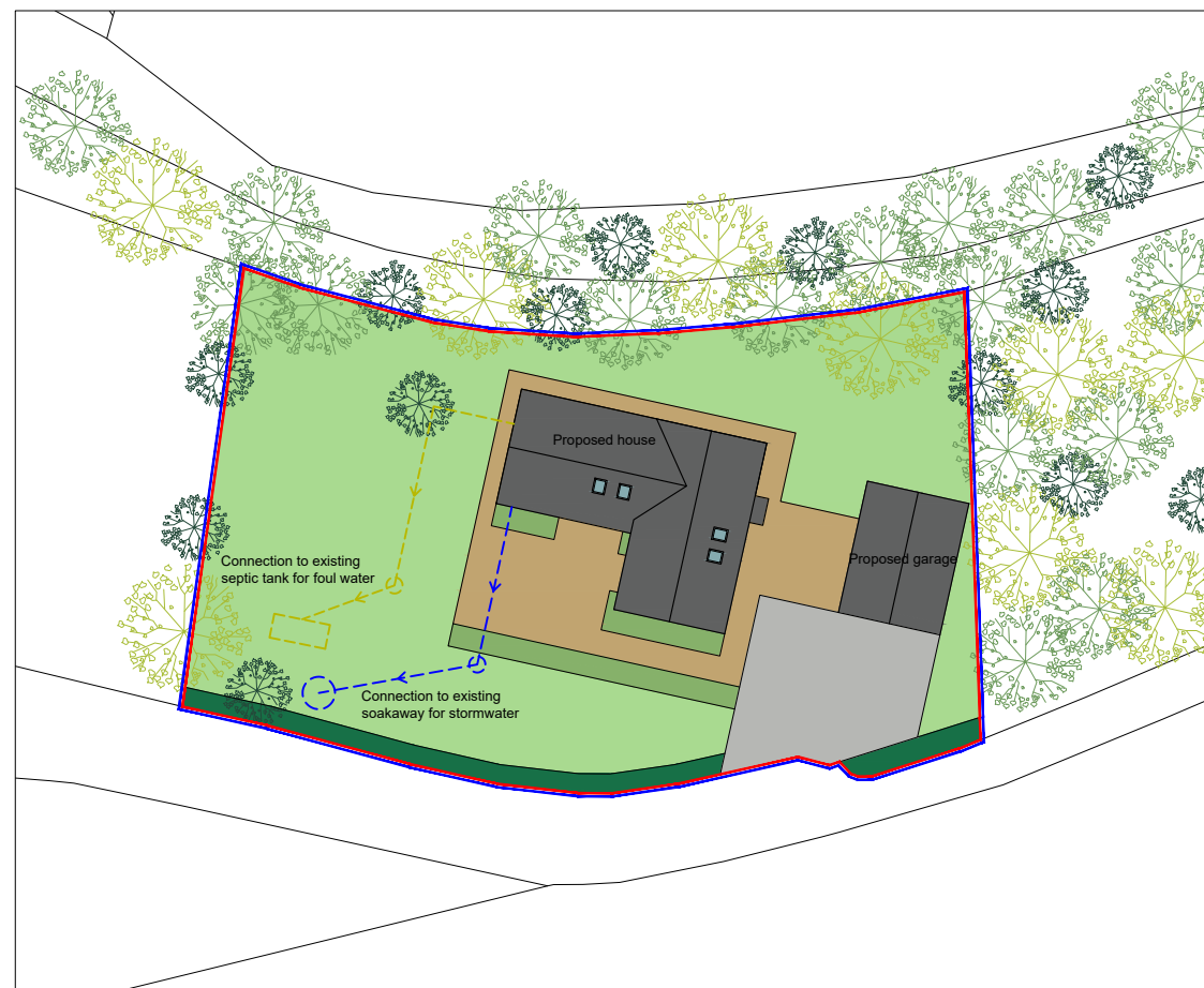
Proposal - Site plan 1:500