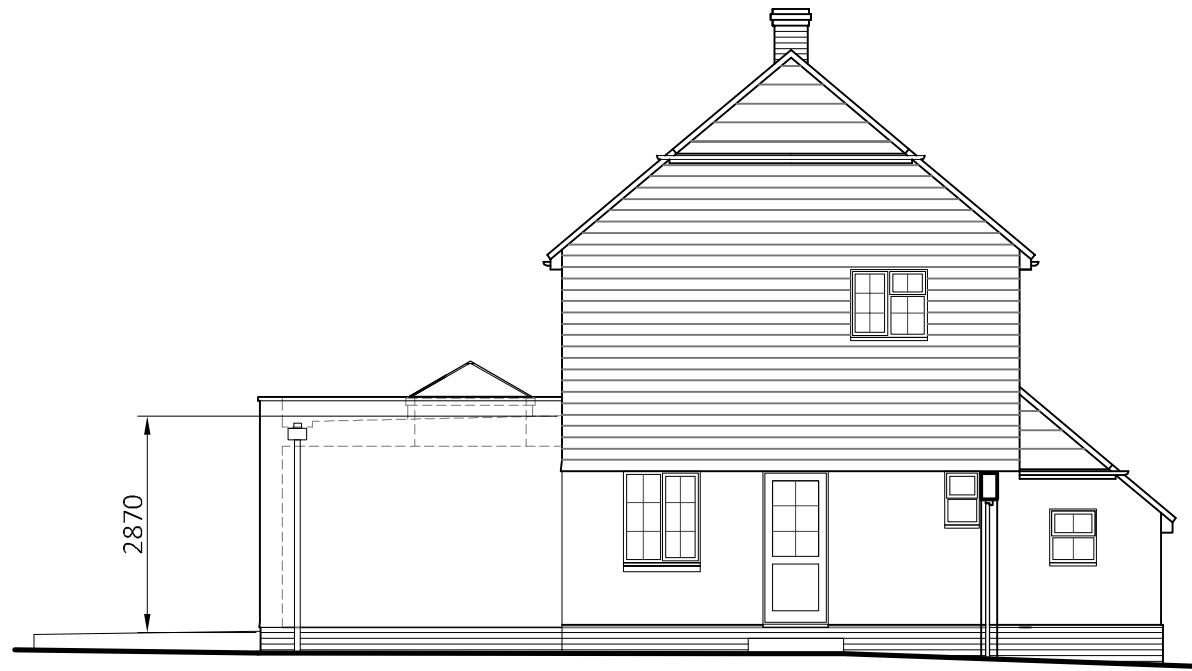
2 EAST SIDE ELEVATION