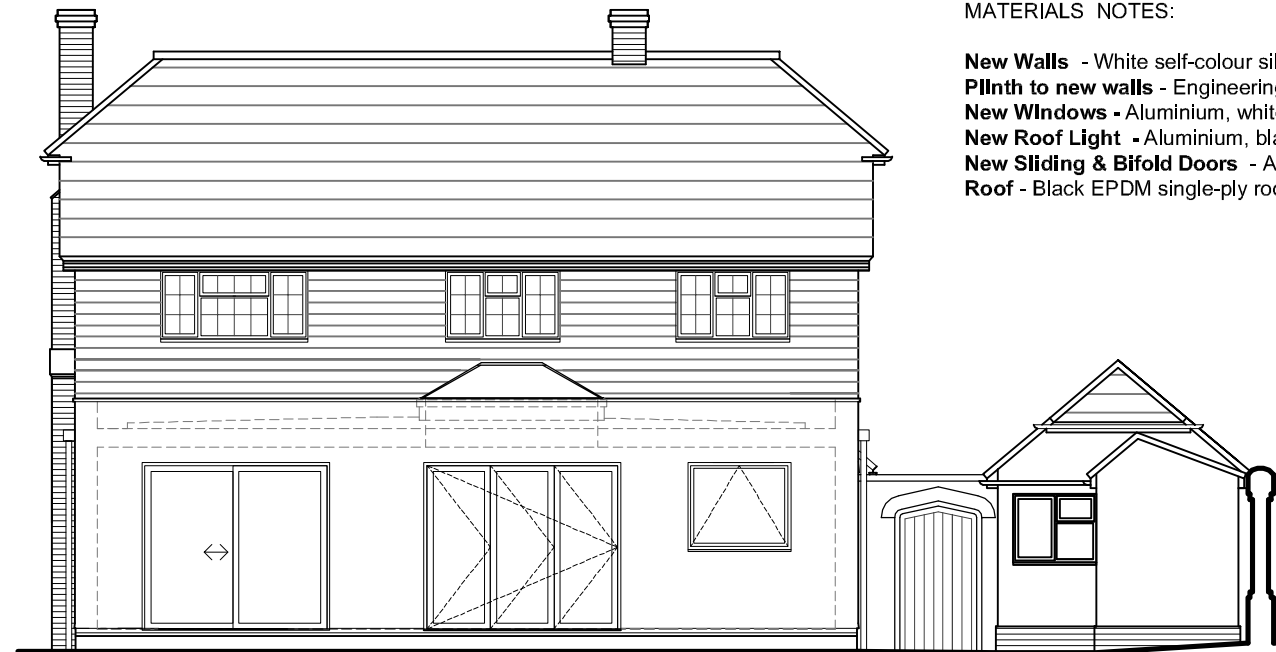
3 REAR ELEVATION