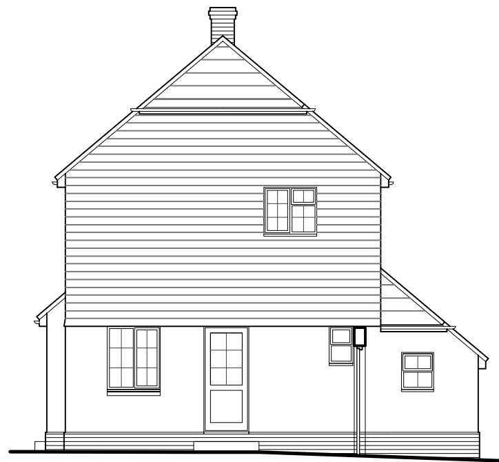
2 EAST SIDE ELEVATION