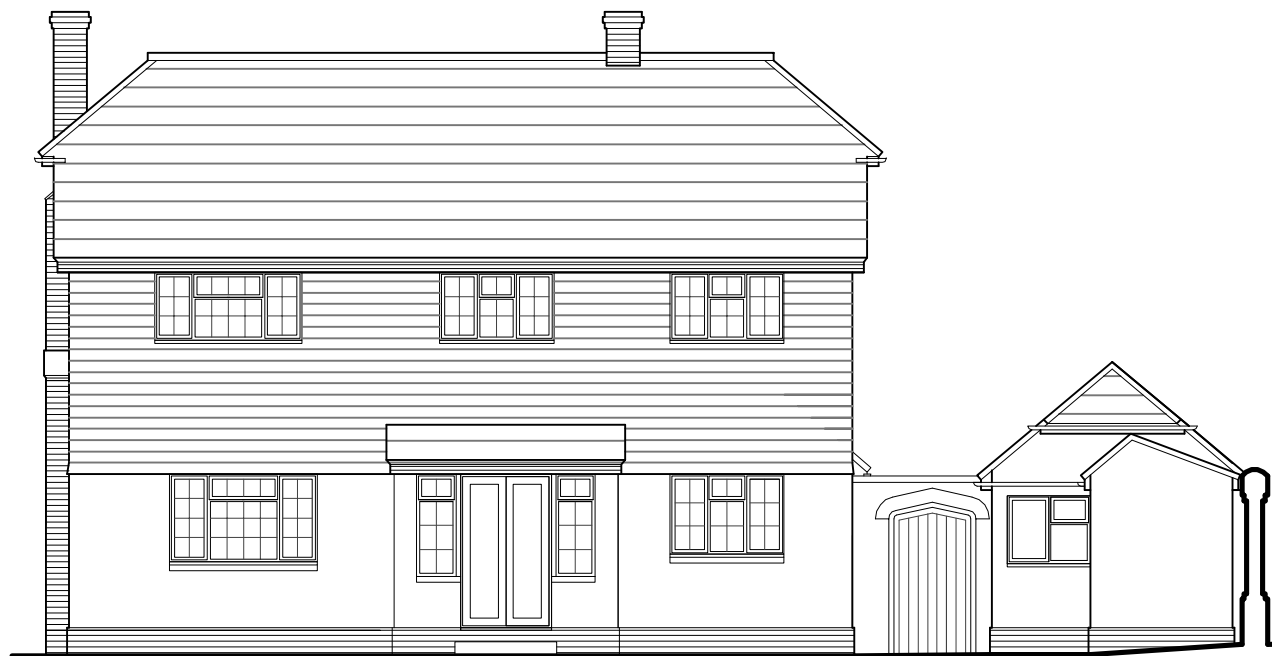
3 REAR ELEVATION