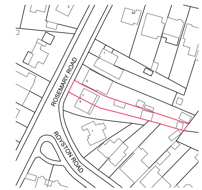
01 Site Location Plan Scale 1:1250