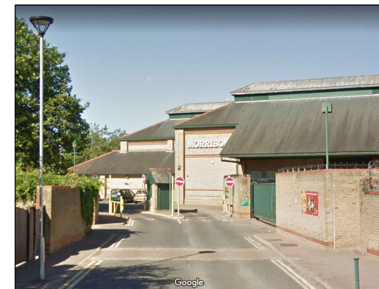
GOOGLE STREET IMAGE SOUTH ROAD CAR PARK ENTRANCE/EXIT