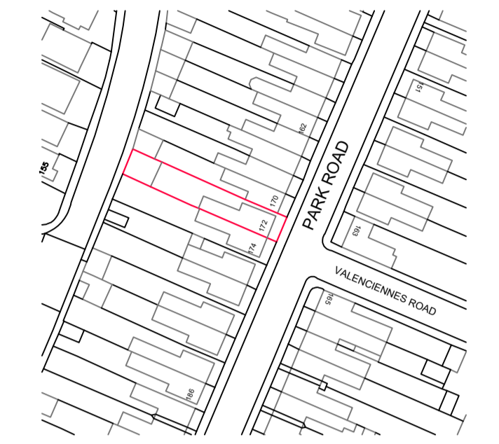
01 Site Location Plan Scale 1:1250