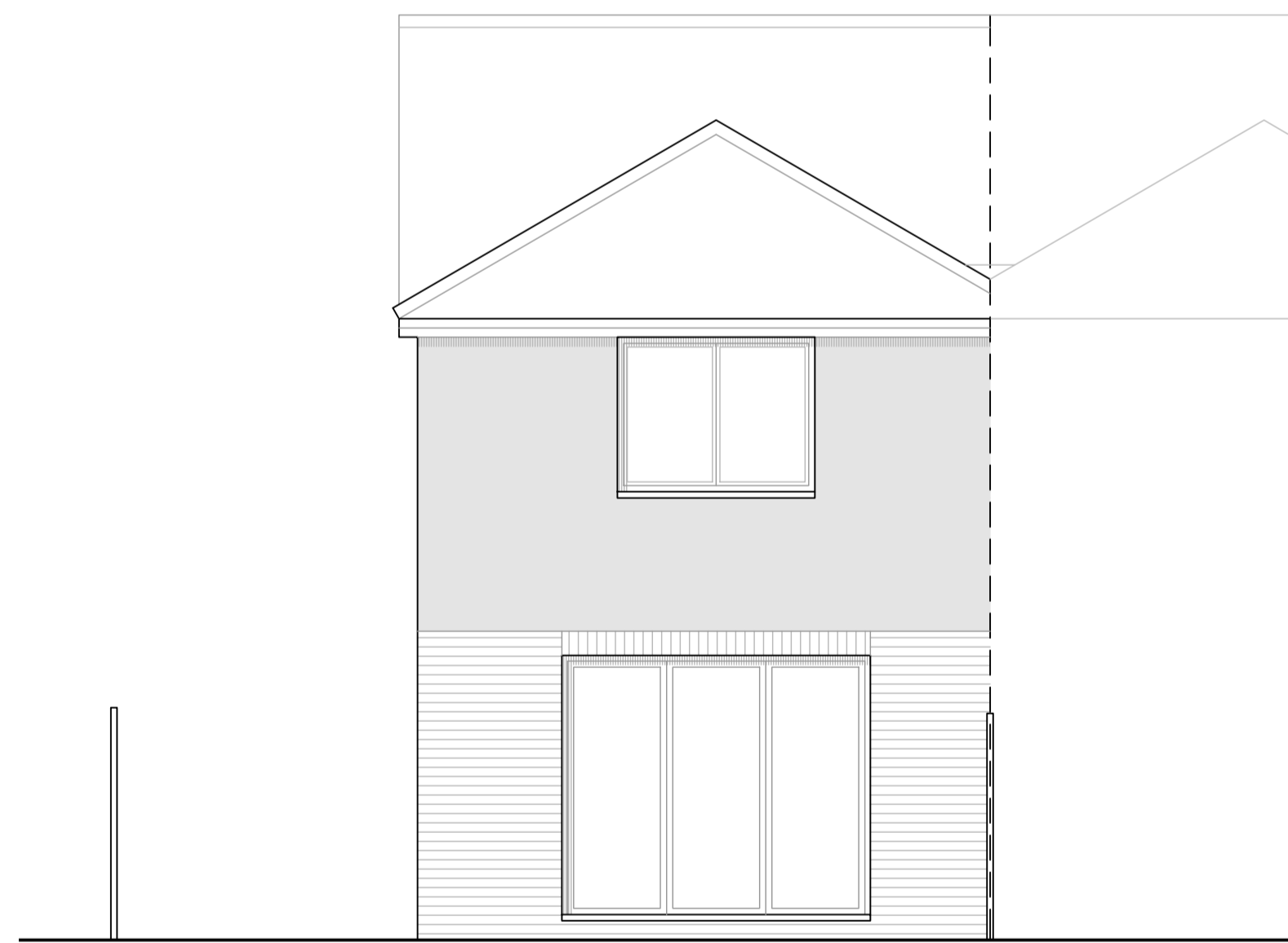
PROPOSED SOUTH ELEVATION SCALE 1:50