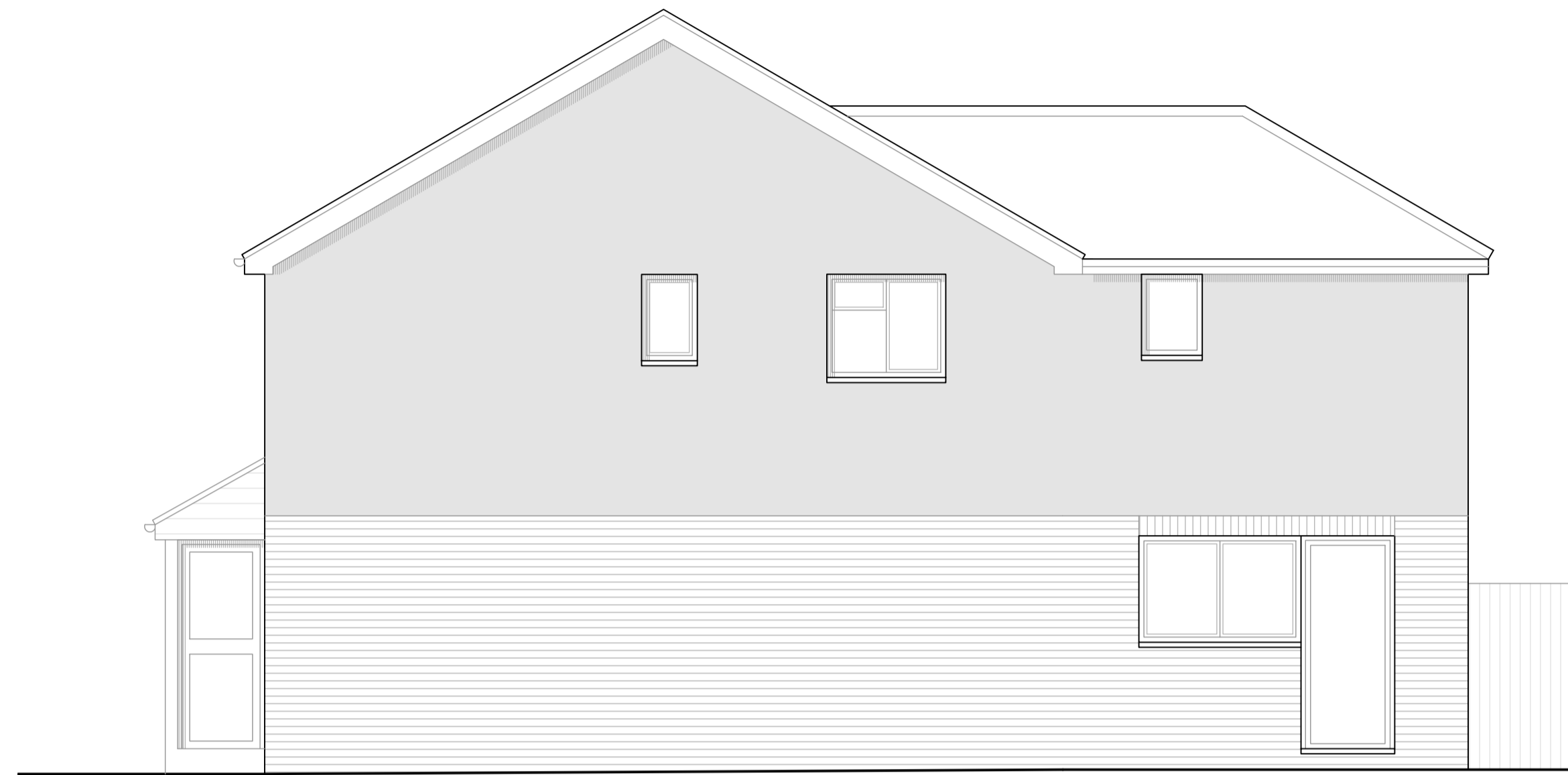
PROPOSED WEST ELEVATION SCALE 1:50