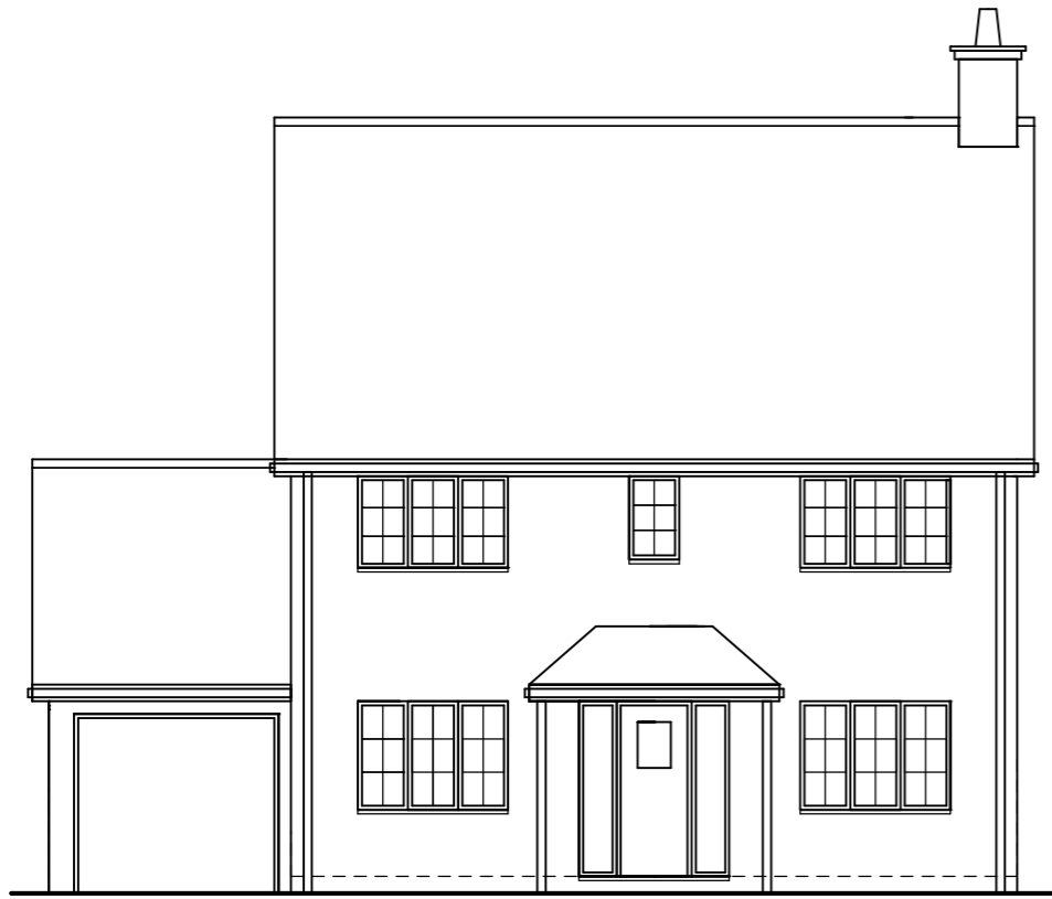
front (southeast) elevation