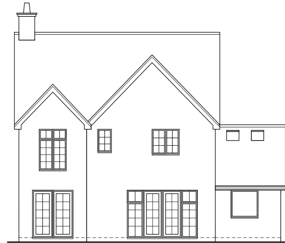
rear (northwest) elevation