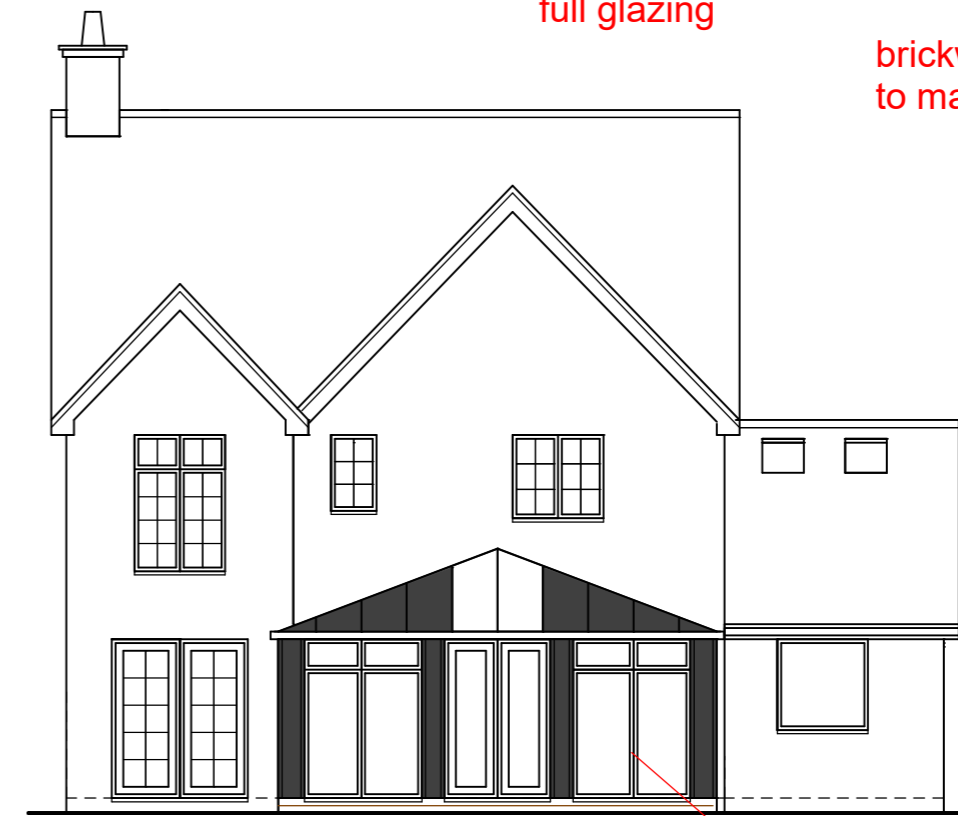
rear (northwest) elevation