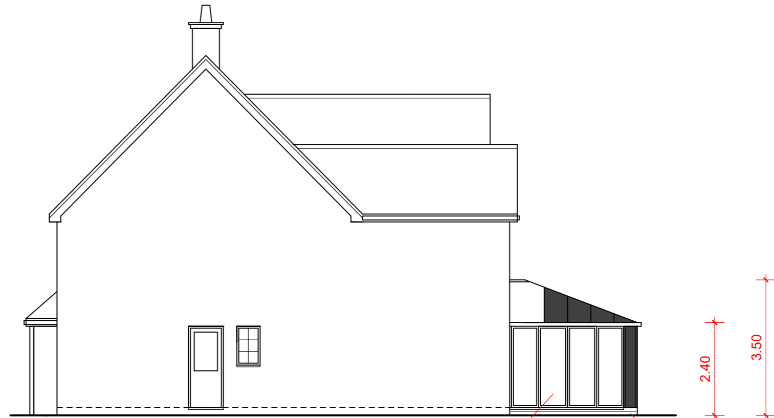
right side (northeast) elevation