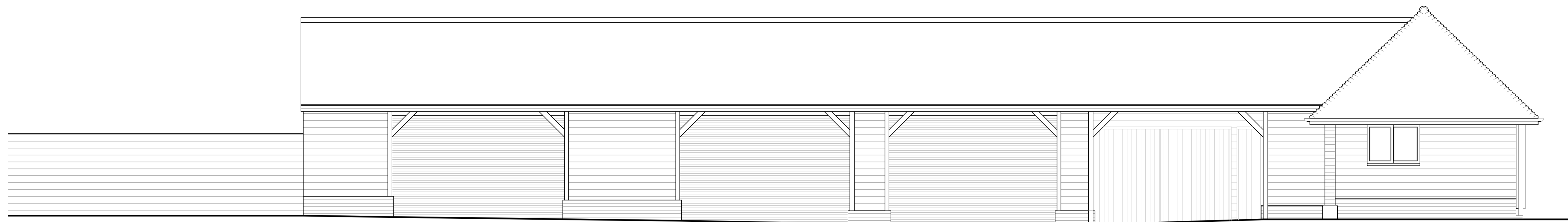
Existing Front (E) Elevation Scale 1:50