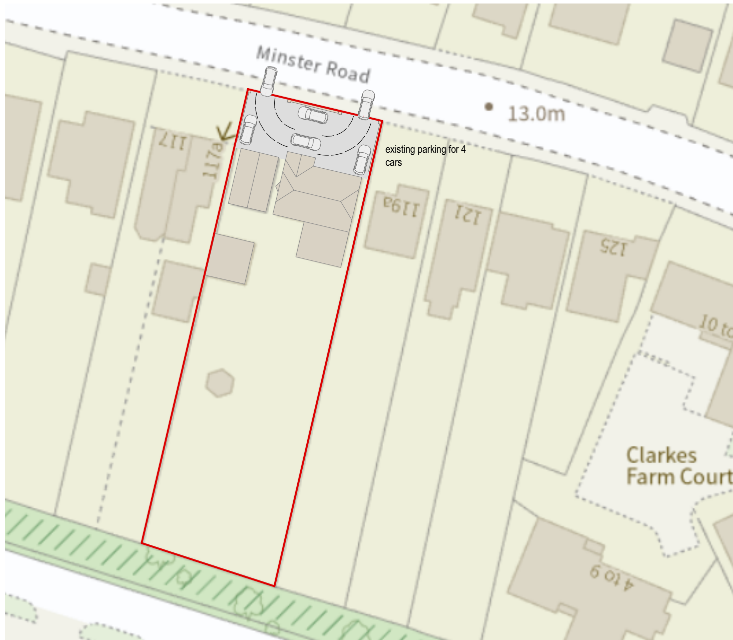
existing site layout & roof plan - 1141 sqm site area - 148 sqm external building footprint incl. garage