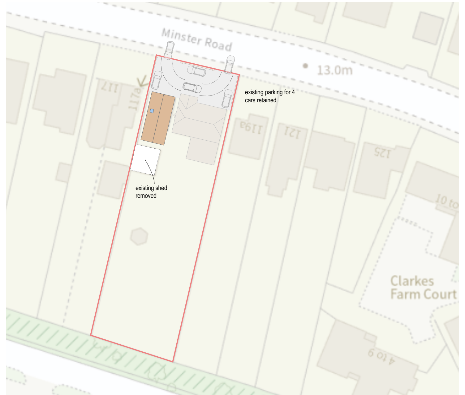
proposed site layout & roof plan