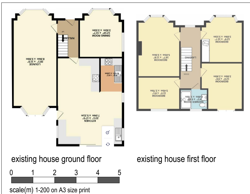
existing house ground floor