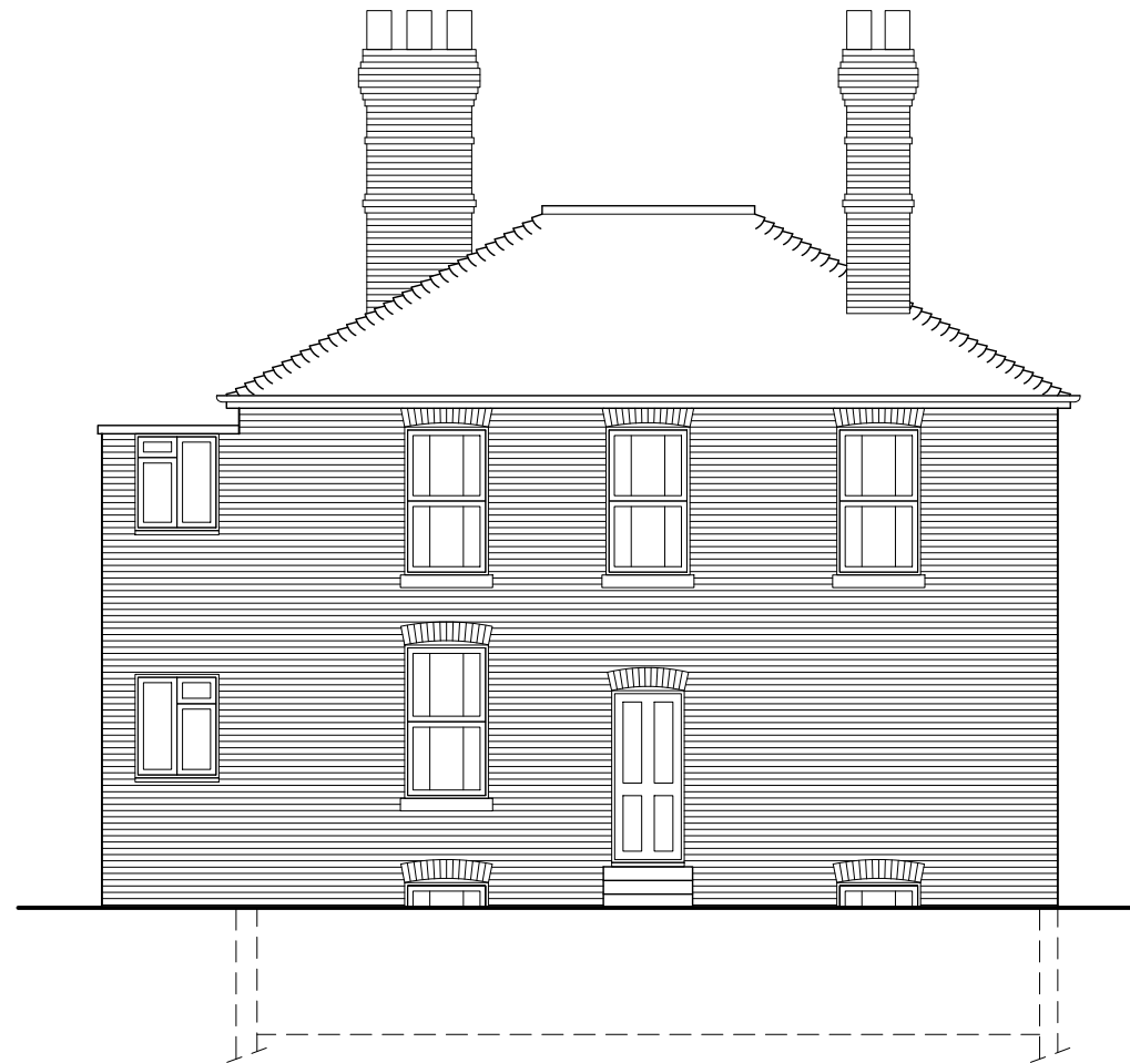
rear - south