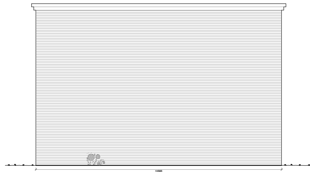
5c Existing Rear Elevation (East) Scale: 1:100