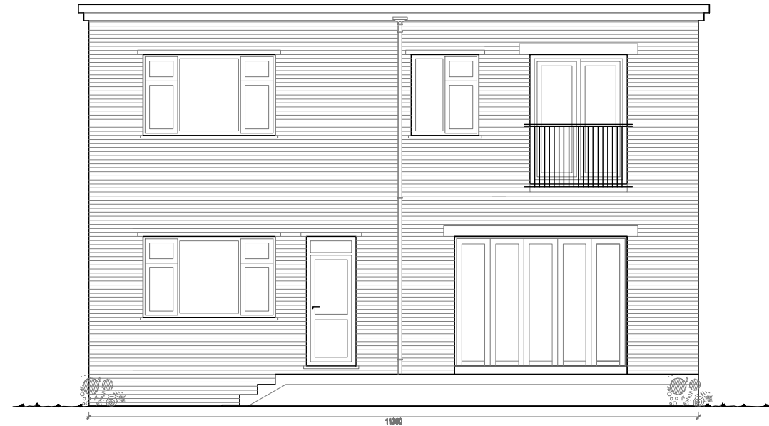
5a Existing Front Elevation (West) Scale: 1:100