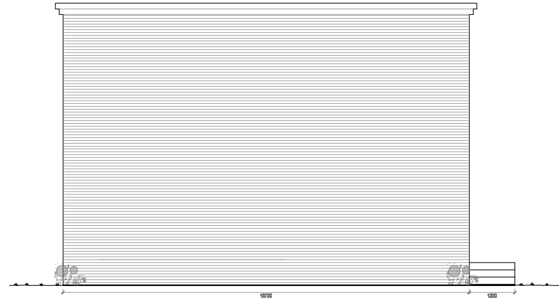
5b Existing Side Elevation (North) Scale: 1:100