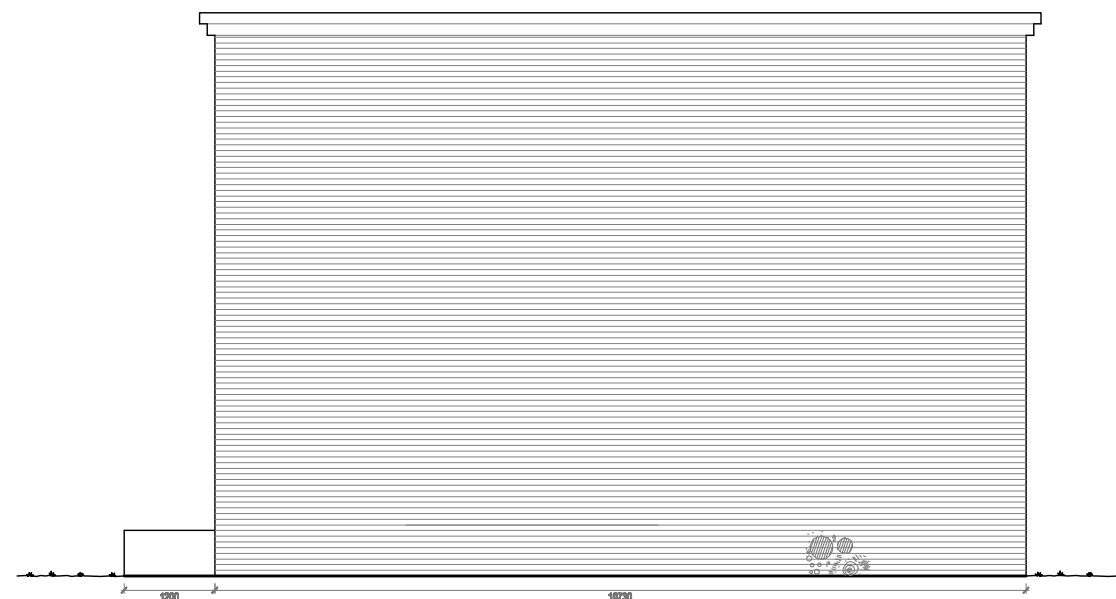
5d Existing Side Elevation (South) Scale: 1:100