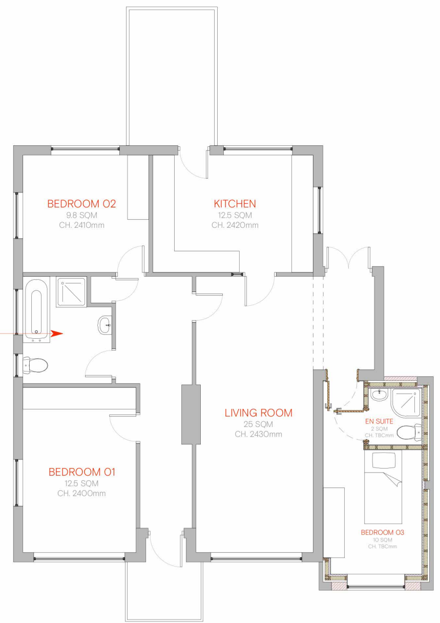
PROPOSED GROUND FLOOR PLAN SCALE 1:100