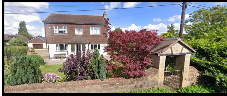
Serenity, South Street Road, Stockbury, Sittingbourne, Kent, ME9 7RB