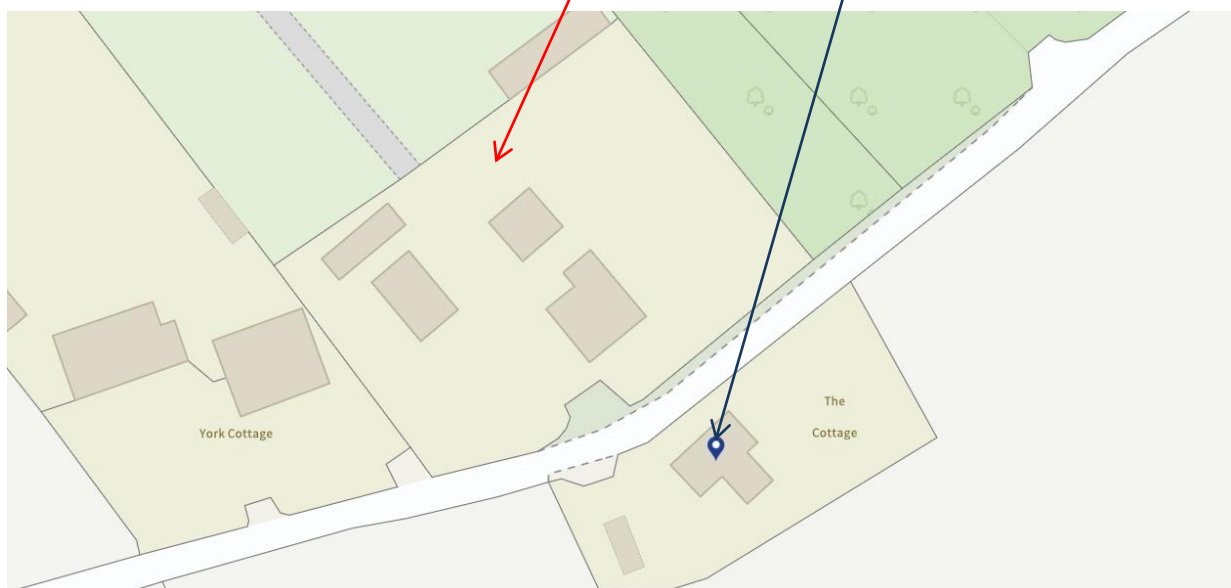
Map: English Heritage. List of Buildings of special Architectural or Historic interest (not to scale)