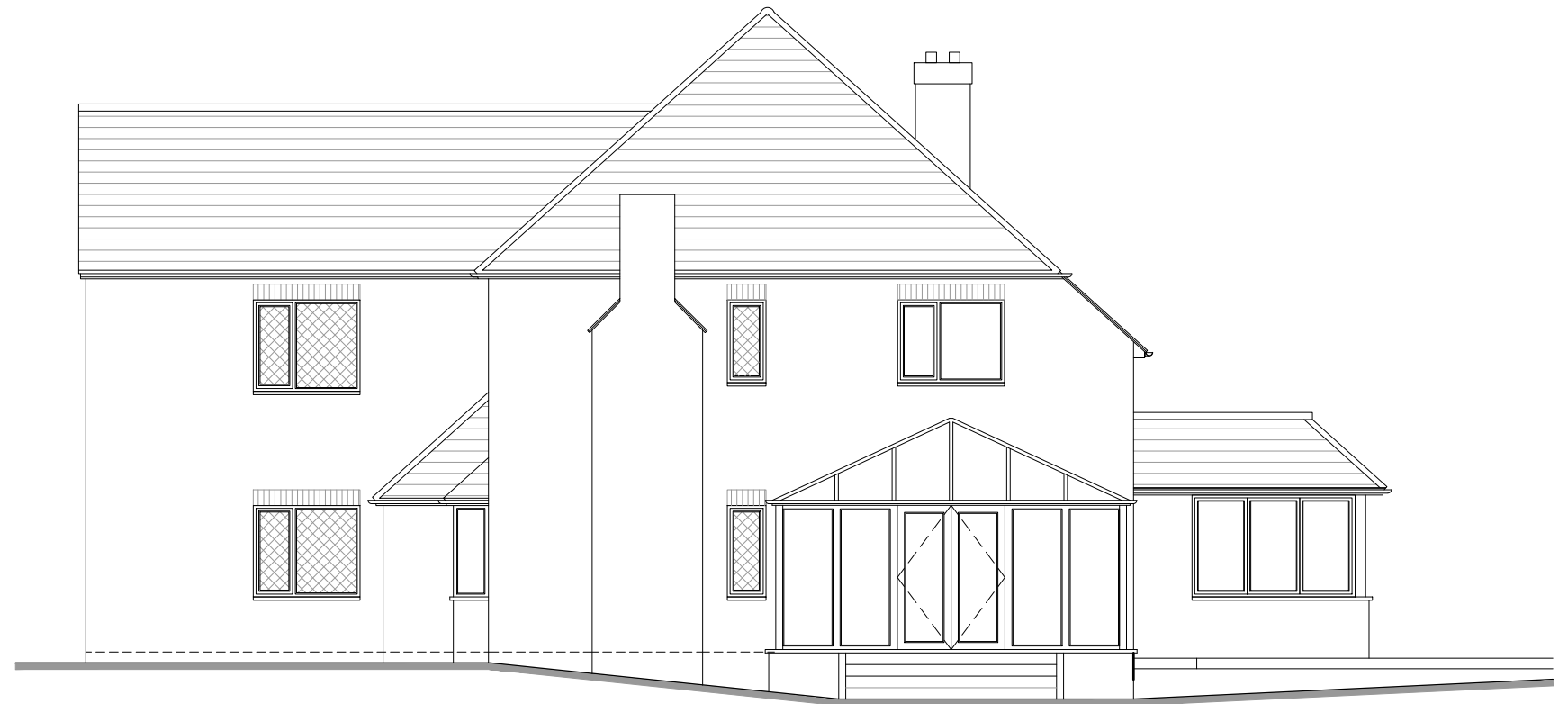
Existing Side Elevation scale 1:100