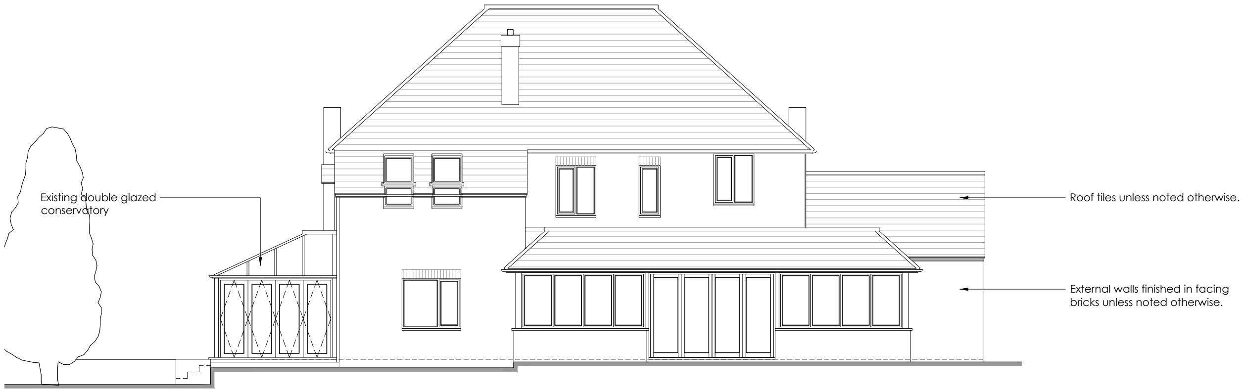
Existing Rear Elevation scale 1:100