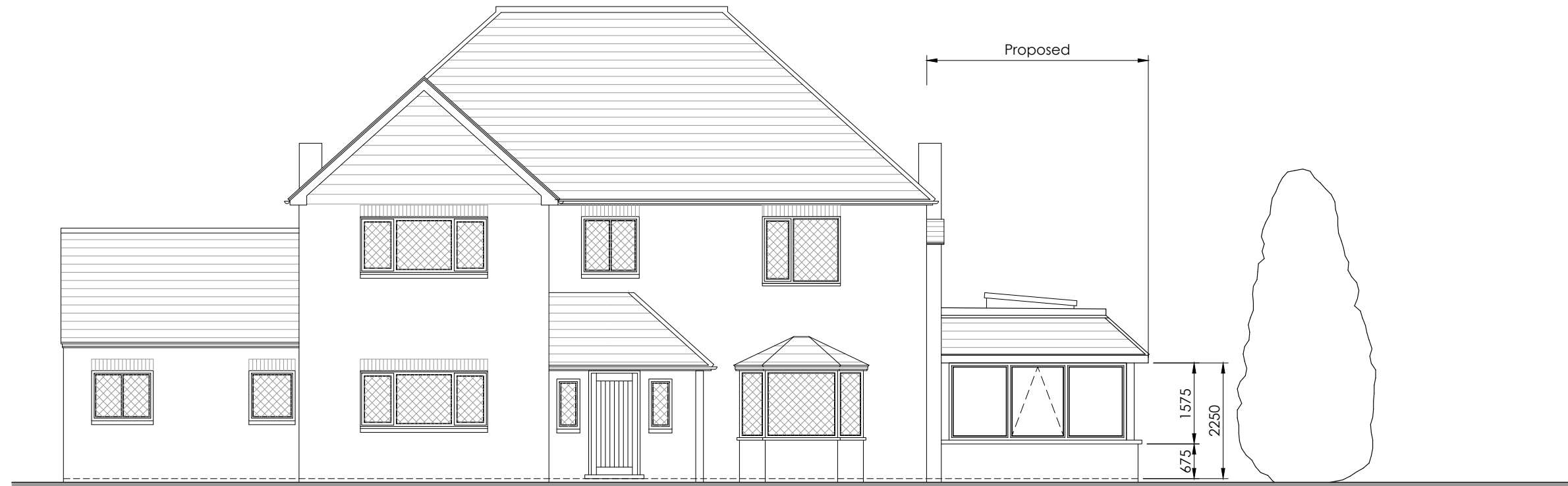
Proposed Front Elevation scale 1:100